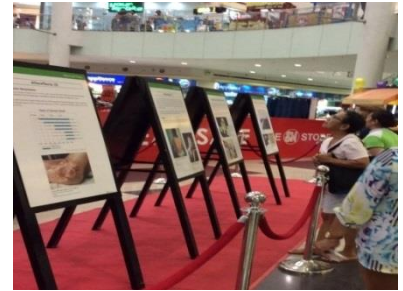
Holding the Mayors for Peace Atomic Bomb Poster Exhibition by a member city (June 2015, Muntinlupa)