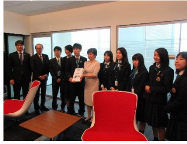
Presenting signatures to the representatives of UN by high school students participating in the petition drive (April 2019, New York)