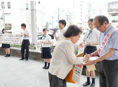
Petition Drive by the President and high school students in the street (July 2019, Hiroshima)