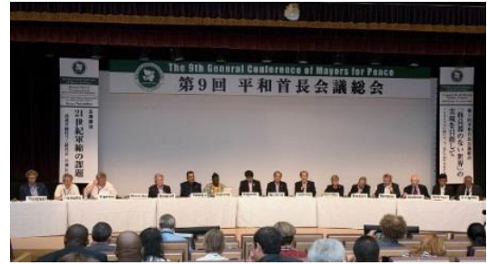
9th General Conference (August 2017, Nagasaki)

Mayors for Peace holds a General Conference once every four years in principle. Hosted alternately between Hiroshima and Nagasaki, the General Conference is an opportunity for member cities to decide and adopt agenda items significant to the organization.