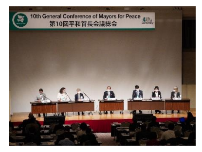
10th General Conference (October 2022, Hiroshima)

Mayors for Peace holds an Executive Conference generally once every two years in one of the executive cities, where executives discuss future initiatives and plans for the next General Conference.