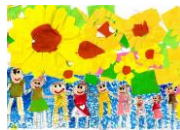
Message from the Artist

I created this work hoping that the peaceful days when we hold hands with our family and people around us and smile together will continue forever.