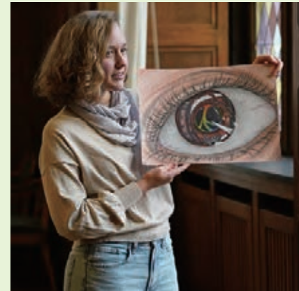
The artwork that won first prize and the artist (Chemnitz, Germany)

Children’s Art Competition “Peaceful Towns”