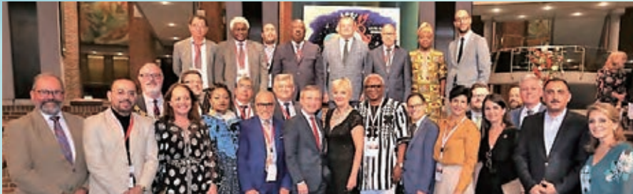
International Mayors Summit on Living Together (Montreal, Canada)

Hold regional conferences aimed at solving local issues