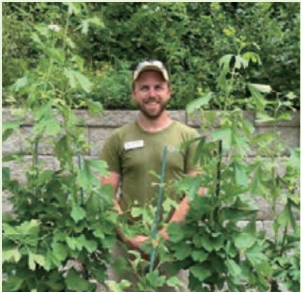
A second-generation atomic bomb survivor tree raised by a member city (Des Moines, US)

Distribute and nurture seeds and seedlings from atomic bomb survivor trees