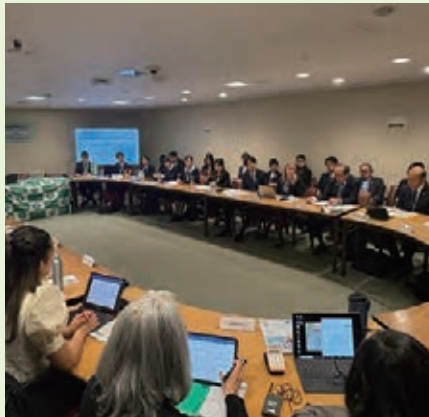
Mayors for Peace Youth Forum (New York, US)