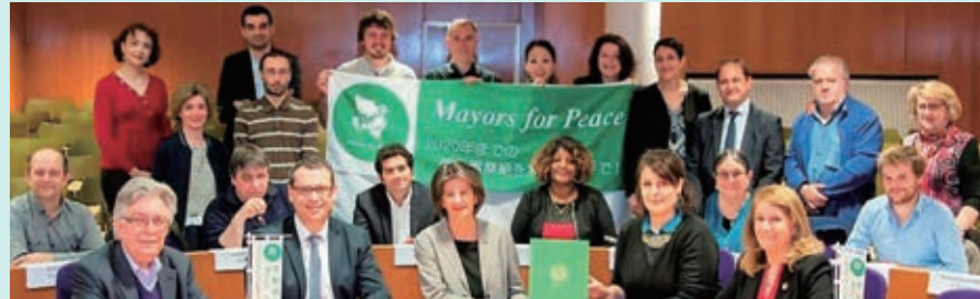
French Chapter conference (Malakoff, France)

Hold regional conferences aimed at solving local issues