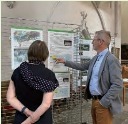
Exhibition held in member city (Greifswald, Germany)

Hold Mayors for Peace Atomic Bomb Poster Exhibitions