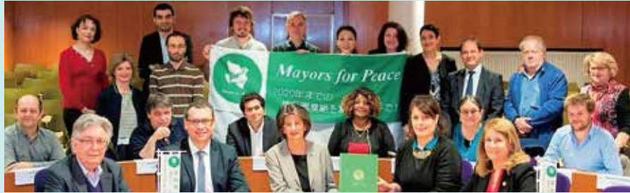
French Chapter conference (Malakoff, France)

Hold regional conferences aimed at solving local issues