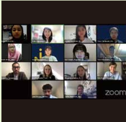
Participants from all around the world