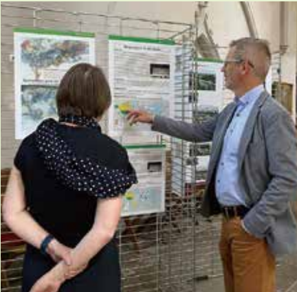
Exhibition held in member city (Greifswald, Germany)

Hold Mayors for Peace Atomic Bomb Poster Exhibitions