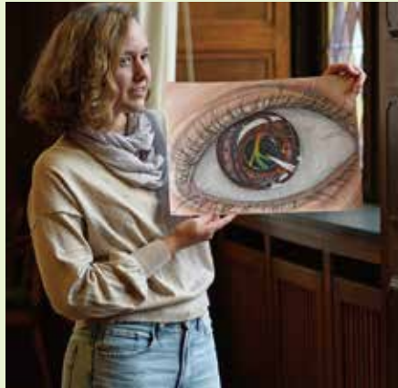
The artwork that won first prize and the artist (Chemnitz, Germany)

Children’s Art Competition “Peaceful Towns”