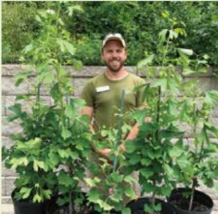
A second-generation atomic bomb survivor tree raised by a member city (Des Moines, US)

Distribute and nurture seeds and seedlings from atomic bomb survivor trees