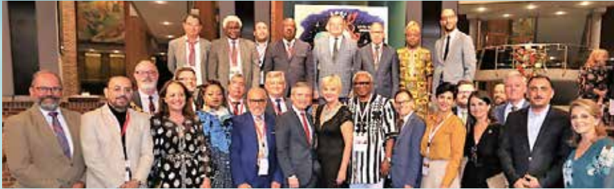
International Mayors Summit on Living Together (Montreal, Canada)

Hold regional conferences aimed at solving local issues