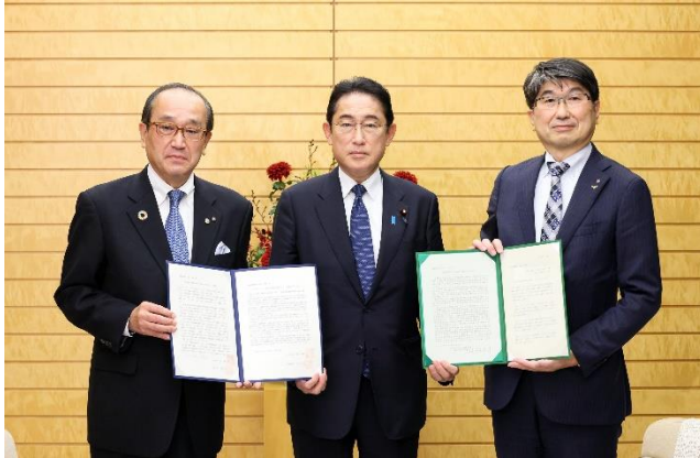
(from left to right) Mayor Matsui of Hiroshima, Prime Minister Kishida, and Mayor Taue of Nagasaki

On December 13, Mayor Matsui of Hiroshima (President of Mayors for Peace) and Mayor Taue of Nagasaki (Vice President of Mayors for Peace) visited the Prime Minister's Office of Japan. There they met with Prime Minister Fumio Kishida of Japan, and directly handed him the Letter of Request to the Japanese Government Calling for the Promotion of Actions to Abolish Nuclear Weapons, which was adopted at the 10th Mayors for Peace Japanese Member Cities Meeting in October, and the Hiroshima Appeal, which was adopted at the 10th General Conference of Mayors for Peace.