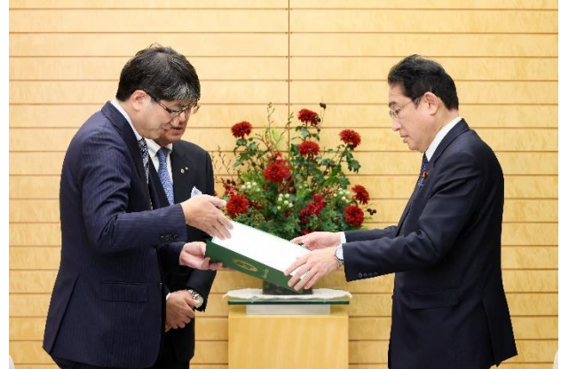
Mayor Taue of Nagasaki handing in the Letter and the Hiroshima Appeal to Prime Minister Kishida

In the letter, the Japan Chapter calls on the Japanese government to: