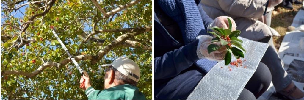
(left) Pruning berries from the Kurogane holly ( Ilex rotunda ) tree (right) Squashing seeds out of the Kurogane berries

As part of this initiative, on the morning of December 10, staff of the Mayors for Peace Secretariat picked seeds of survivor trees ( hibaku jumoku ) in Hiroshima, together with some of the organizations comprising “Hiroshima Hibaku Jumoku Working Group,” such as Green Legacy Hiroshima Initiative, which organized the seed picking.