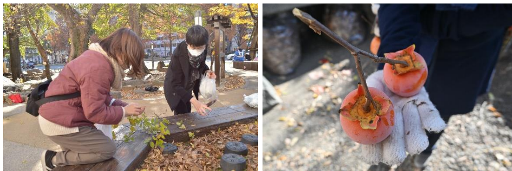
(left) Picking berries of the Japanese hackberry trees ( Celtis sinensis var. japonica ) (right) Fruits of the Japanese persimmon ( Diospyros kaki )

The group next went to a green area in front of Shirakami Shrine on the Peace Boulevard. Before the bombing, this site, 530 meters south of the hypocenter, was the grounds of Kokutaiji Temple. While many of the trees were lost in the bombing, 11 trees continued to grow. The Secretariat staff and the other groups picked berries of the two Japanese hackberry trees ( Celtis sinensis var. japonica ) and pruned fruits of the Japanese persimmon ( Diospyros kaki ).