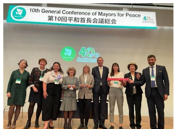
Representatives of Member Cities in Europe at the 10th General Conference of Mayors for Peace in Hiroshima

The main gathering of the Mayors for Peace network, the 10th General Conference of Mayors for Peace in Hiroshima on October 19 and 20, revamped international cooperation initiatives between local governments on the peace agenda. The European local governments of Granollers, Malakoff, Biograd na Moru, Evora and Oslo took an active role during the conference, showcasing the outcomes of joint initiatives held within the Mayors for Peace European Chapter and national chapters. Leading cities from Hannover and Manchester also participated in the Conference online and contributed to the discussions.