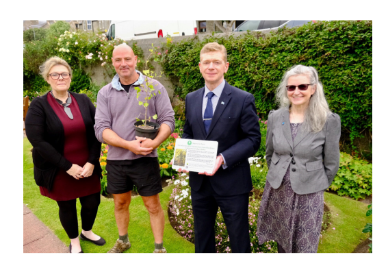
The Convener of Shetland Islands Council with a plaque and a Hiroshima gingko peace tree