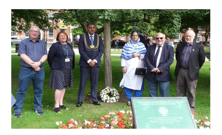
Some of the core attendees to the Leeds Hiroshima – Nagasaki Day event – the Chapter Secretary, the Deputy Leader of Leeds City Council, the Lord and Lady Mayoress, the NFLA and CND Chairs