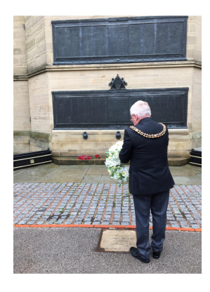
The Lord Mayor of Manchester laying a wreath on Hiroshima Day at Manchester University