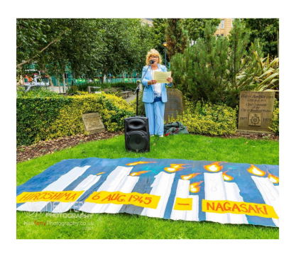
The Deputy Mayor of Bradford speaking at its Hiroshima and Nagasaki Day event