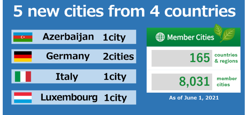
Help us achieve 10,000 member cities!