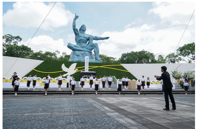
Peace Memorial Ceremony of Nagasaki