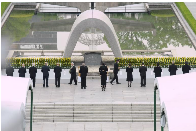
Peace Memorial Ceremony of Hiroshima

At each city's ceremony, each mayor made his Peace Declaration for the abolition of nuclear weapons and the realization of a lasting world peace.