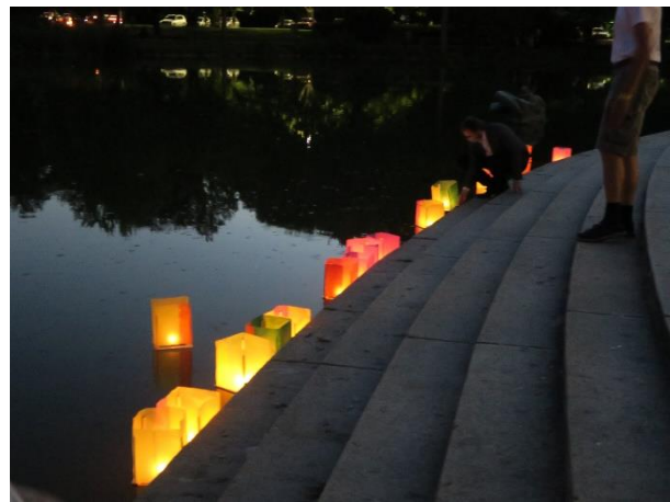
Evening ceremony setting out lanterns in remembrance of the hibakusha