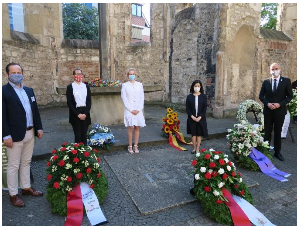
Morning ceremony with Mayor Onay and guests at the Aegidien Church Hannover

In the evening at 9 pm Hannover held a reflective remembrance called "Message for Tomorrow" to call attention to the earnest wish of the hibakusha for lasting world peace. Floating lanterns on the pond behind the Town Hall closed the day of remembrance.