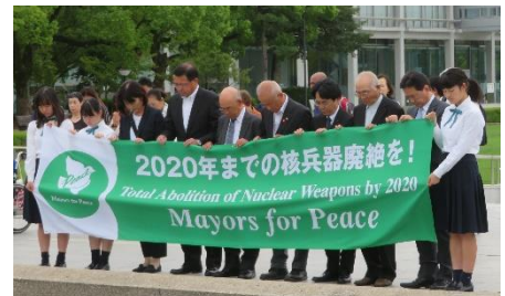
Event to mark the IDP 2019 in Hiroshima

Mayors for Peace has been a long-time supporter of the IDP and encourages all member cities to commemorate the International Day of Peace on September 21. In accordance with these initiatives, the City of Takayama, Japan, a member city of Mayors for Peace, will organize a Peace Bell Ceremony where like-minded bell owners in the city, such as temples and churches, will sound their bells in unison at noon on the IDP. Furthermore, the mayor of Takayama City requests our member cities to do the same at noon in their own local times, in order to offer as many people as possible an opportunity to renew their determination to bring peace to the globe.