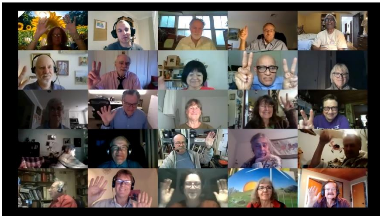
Online video conference of Abolition 2000 Annual General Meeting

▼ Visit the link below for more background on Abolition 2000, reports from working groups and affiliated networks, video clips and more: