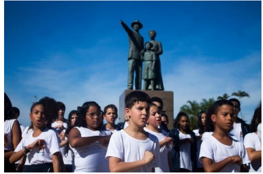
“Nuclear Disarmament Day” in Santos Children singing songs about peace

The Mayors for Peace Secretariat has been seeking examples of peace education initiatives conducted by any organization (city hall/school/NGO, etc.) in Mayors for Peace member cities that are conducive to raising peace-seeking spirit among future generations. The Mayors for Peace Secretariat accepts reports on a rolling basis, so please send your report whenever your project is completed. The submitted reports will be posted on our website and in the Mayors for Peace News Flash as a source of information for other member cities that are planning to launch their own peace education program.