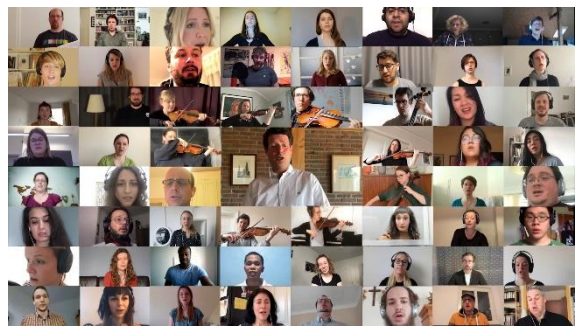
"I HOPE" performed by the World Choir for Peace

The World Choir for Peace, founded in Berlin in 2018, has recorded the song "I Hope" composed by a Norwegian composer Kim André Arnesen together with the Chamber Choir Hannover. The City of Hannover promotes and supports this initiative as a choir city, UNESCO City of Music and a Mayors for Peace Lead City. The video illustrates that despite the COVID-19 pandemic, it is possible to make music together and send a sign of hope and peace into the world.