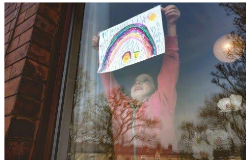
Girl putting a picture of rainbow on window (Manchester)