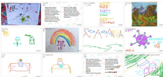
Drawings by children (Barcelona)

In Manchester, UK, the streets are empty but people are staying in touch as best as they can. Many neighborhoods across the city have set up online chat groups for individual streets where neighbors can talk, ask for help and exchange information. Movements to support each other are growing, such as putting up pictures of rainbows in their windows to give walkers an uplifting message of solidarity.