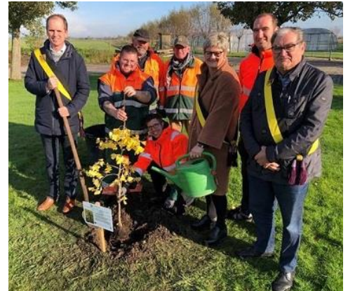
Planting ceremony in Veurne, Belgium, in November 2019

http://www.mayorsforpeace.org/english/ecbn/projects.html#section04