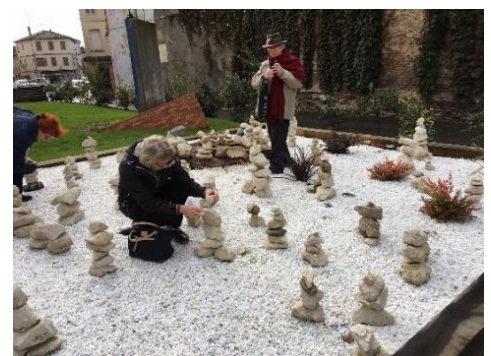
The peace rock garden Moissac installed with the collaboration of “Sentries of Peace”

Moissac joined Mayors for Peace on December 1st last year through an invitation from a local citizens’ group named “Sentries of Peace”. This group highlights the importance of passing down the messages of the hibakusha of Hiroshima and Nagasaki to the younger generation and promotes an art activity involving stacking stones into towers as prayers for peace. The concept behind this is: “The stone towers symbolize the fragility of peace that must be protected and constantly rebuilt.” On October 24, the town inaugurated a rock garden built with this concept. Later, when the stone towers in this garden were destroyed by rain and wind, citizens spontaneously rebuilt them.