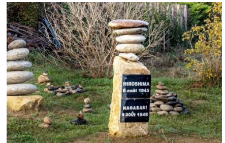
On one of the stone towers inscribed the dates of the atomic bombings of Hiroshima and Nagasaki.