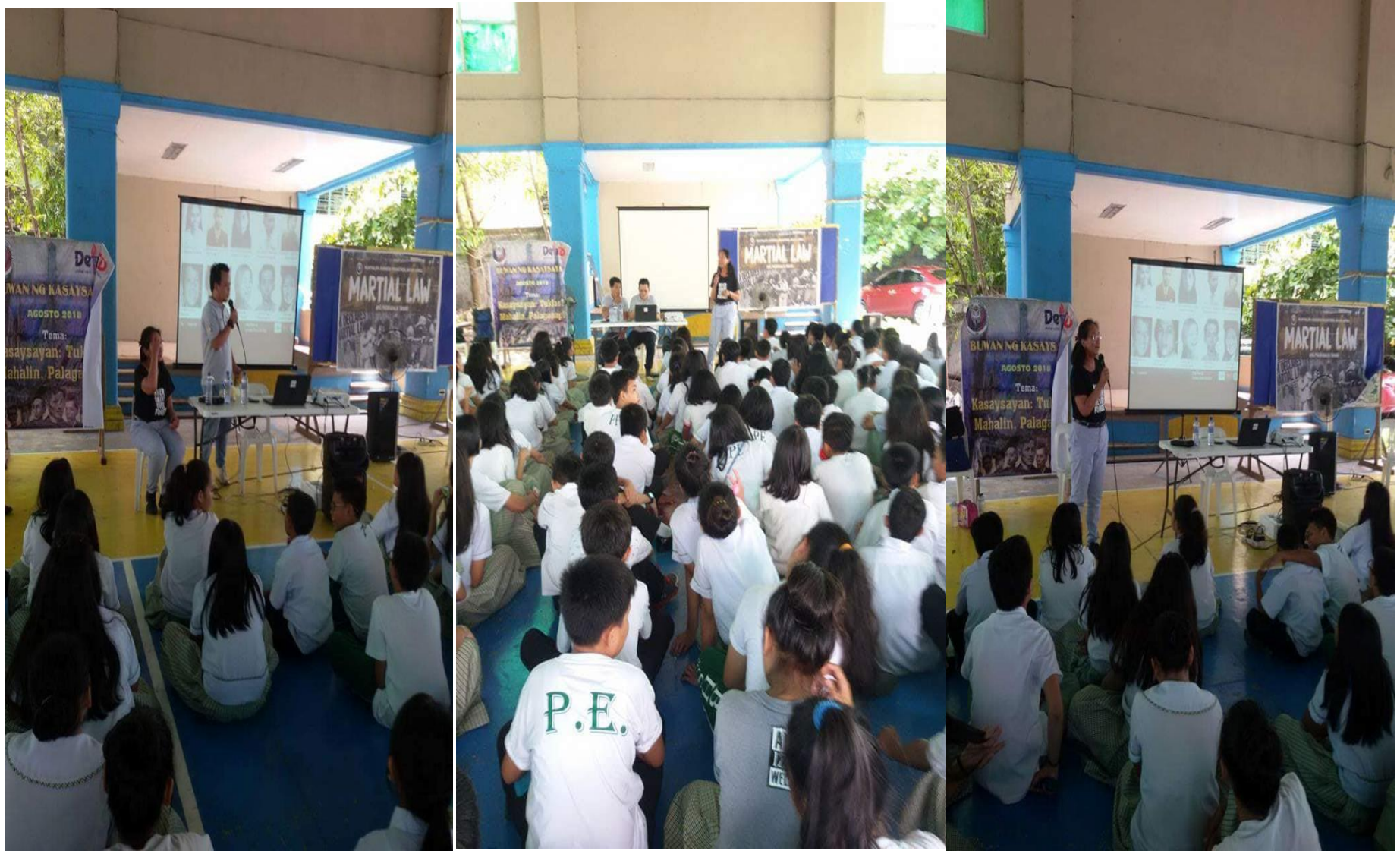
“Seminar-Workshop on Martial Law”