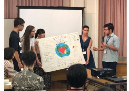
Mayors for Peace workshop during IYCPF on August 7

The International Youth Conference for Peace in the Future (IYCPF) is an annual youth conference which aims to bring together youth (high school and college students) from cities including Hiroshima's sister and friendship cities and have them think about peace. Four young representatives from Grigny (France), Hannover (Germany), Tehran (Iran), Ypres (Belgium) attended this conference with the support from Mayors for Peace.