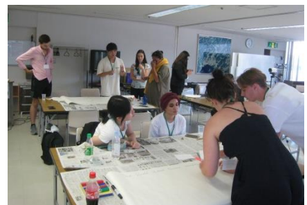
Mayors for Peace workshop during "HIROSHIMA and PEACE" on August 7

Eight young representatives from eight member cities around the world attended the Hiroshima City University's intensive summer course "HIROSHIMA and PEACE", in which students from around the world study and discuss Hiroshima and peace in English. In addition to the university's course, they attended a Mayors for Peace workshop where each of them gave a presentation about their city's peace activities and shared their views on nuclear disarmament and peace.