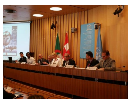
Round table on "Improving How We Live Together in Cities"

This celebration was an opportunity to mobilize efforts of the international community to make efforts in favor of peace, tolerance, inclusion, mutual comprehension and solidarity and to express a profound desire to live and to act together, unified in difference and in diversity in order to build a sustainable world based on peace, solidarity and harmony.