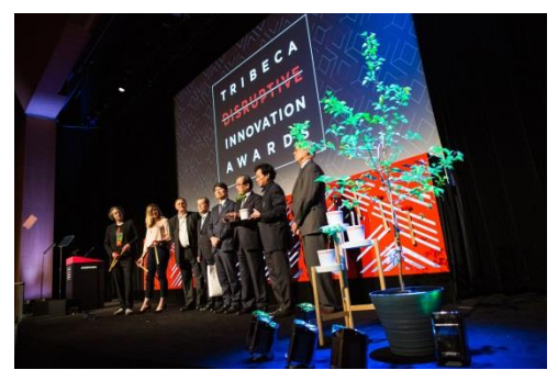
The 10th Annual Tribeca Disruptive Innovation Awards Ceremony

The Mayors of Hiroshima and Nagasaki, the Mayor of the US Lead City Des Moines, Iowa, and the Secretary-General of Mayors for Peace attended the awards ceremony held in New York on May 3. Both a seedling of a callery pear tree that endured the 9/11 terror attacks on the