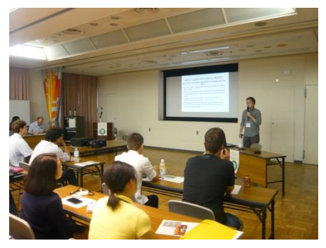
A youth from a Mayors for Peace member city giving a presentation during the 2017 program

This conference is hosted alternately by the City of Hiroshima and its sister and friendship cities and this year's conference will be held in Hiroshima from August 4 to 12. Since 2017, Mayors for Peace has provided financial and other support to selected youth participants from member cities in years when the conference has been hosted by the City of Hiroshima and is currently accepting applications for participation from member cities.