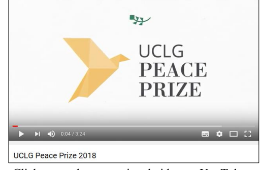
Click to see the promotional video on YouTube

The Prize celebrates successful initiatives undertaken by cities who either work to prevent or overcome conflicts in their own