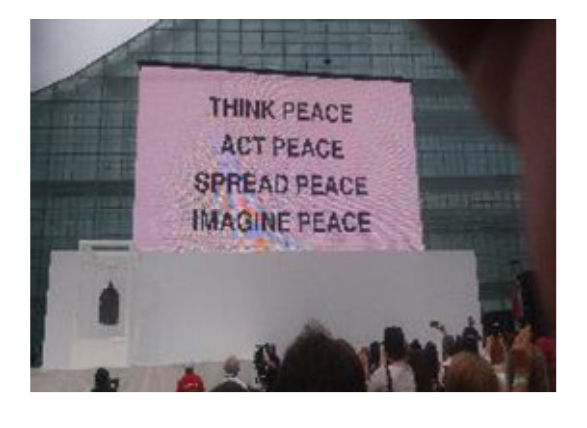
The message of the bells for peace event within the Manchester International Festival