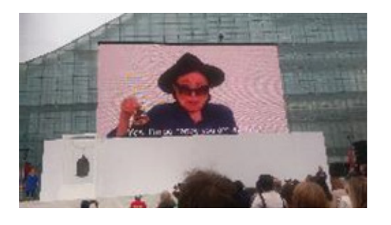
Yoko Ono leaves the 4,000 participants in the Bells for Peace mantra