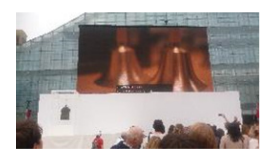
A couple of the bells for peace – 4,000 were rung during the event