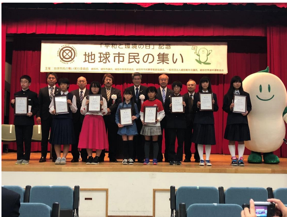
Awards ceremony for winners

If you would like to submit photos and other materials, please send them in a separate file.