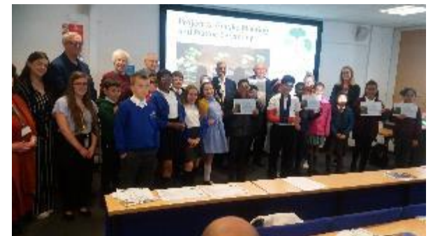
Some of the Project G participating school children receiving tree plaques