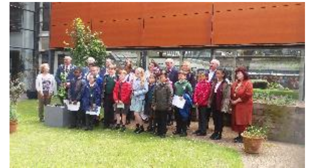
Manchester's gingko tree planted at MMU