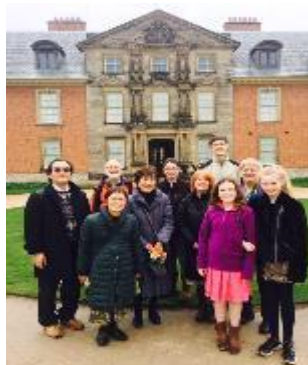
Children with the hibakusha visiting the gingko trees