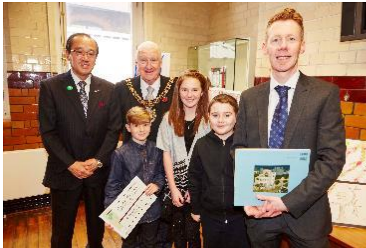
Lord Mayor and Mayor of Hiroshima and children from St Margaret Mary's School