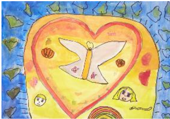
Some Project G art