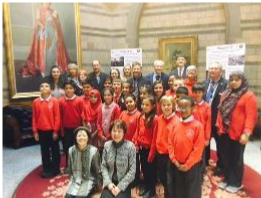
Hibakusha & Manley Park pupils