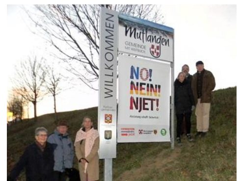
Peace group members beside the town sign of Mutlangen, Germany