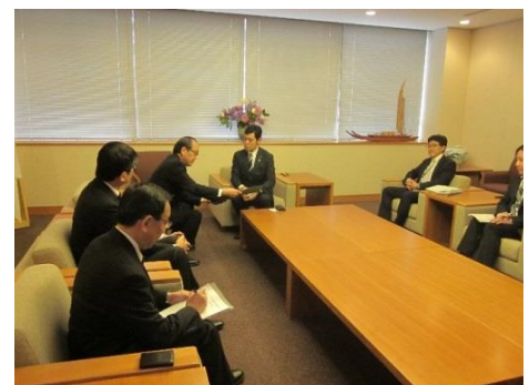
Representatives of the Japanese member cities of Mayors for Peace meeting with Parliamentary Vice Minister Tsuji on November 9

On November 9, in accordance with the decision at the Meeting, Mayor Matsui of Hiroshima (President of Mayors for Peace) and Mayor Taue of Nagasaki (Vice President of Mayors for Peace) and a representative of Takayama City visited the Ministry of Foreign Affairs of Japan and handed Mr. Kiyoto Tsuji, Parliamentary Vice Minister for Foreign Affairs, a letter of request addressed to Prime Minister Shinzo Abe.