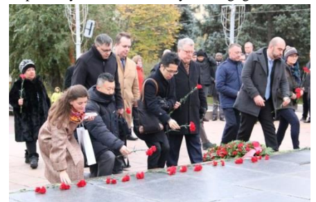
Participants of the IAPMC General Assembly laying flowers to the Eternal Fire Memorial in Volgograd