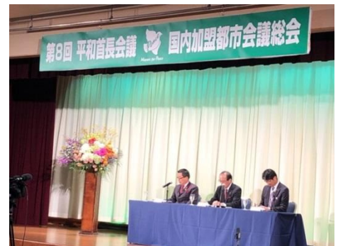
Press conference on the Japanese Member Cities Meeting by the Mayors of Takayama, Hiroshima, and Nagasaki on November 6

On November 5 and 6, the 8th Japanese Member Cities Meeting was held in Takayama City, Gifu Prefecture, attended by 148 representatives from 91 municipalities, including 39 municipal heads. The participants discussed and approved the agenda items including the submission of a letter of request to the Japanese government and the intensification of efforts in membership expansion through inviting sister/friendship cities.