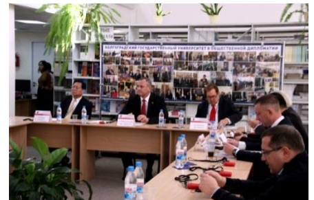
Round table of the International Forum of People's Diplomacy

http://www.mayorsforpeace.org/english/whatsnew/activity/181207_Volgograd_events.html