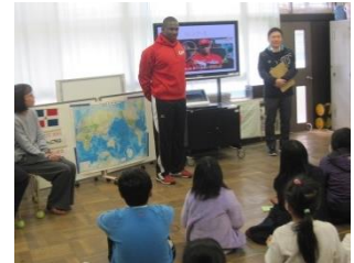
Day of Global Understanding

Upon entering school, such students take a vocabulary test and are interviewed so the school can assess their proficiency in Japanese. Based on the result, the school creates an individual teaching plan. Depending on their Japanese level, the students either learn in a small group away from their class or take regular classes with other Japanese students with the help from an assisting teacher. The school holds a gathering once a month for such students with international backgrounds so that they can build ties with each other, establish their identity and cherish the culture of their origin.