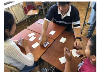
Teaching in a small group

Motomachi Elementary School is located in the city’s largest public housing area. In the 1980s, Japanese nationals who had been living in China during the war began to settle in this area, and later started to bring their families from China. As the school received more such returnee students, a special Japanese language class named “Global Friendship Class” was established. Today, about 65 percent of the students have their roots in countries other than Japan, including not only China but also the Philippines, the U.S., Nepal, and Indonesia.