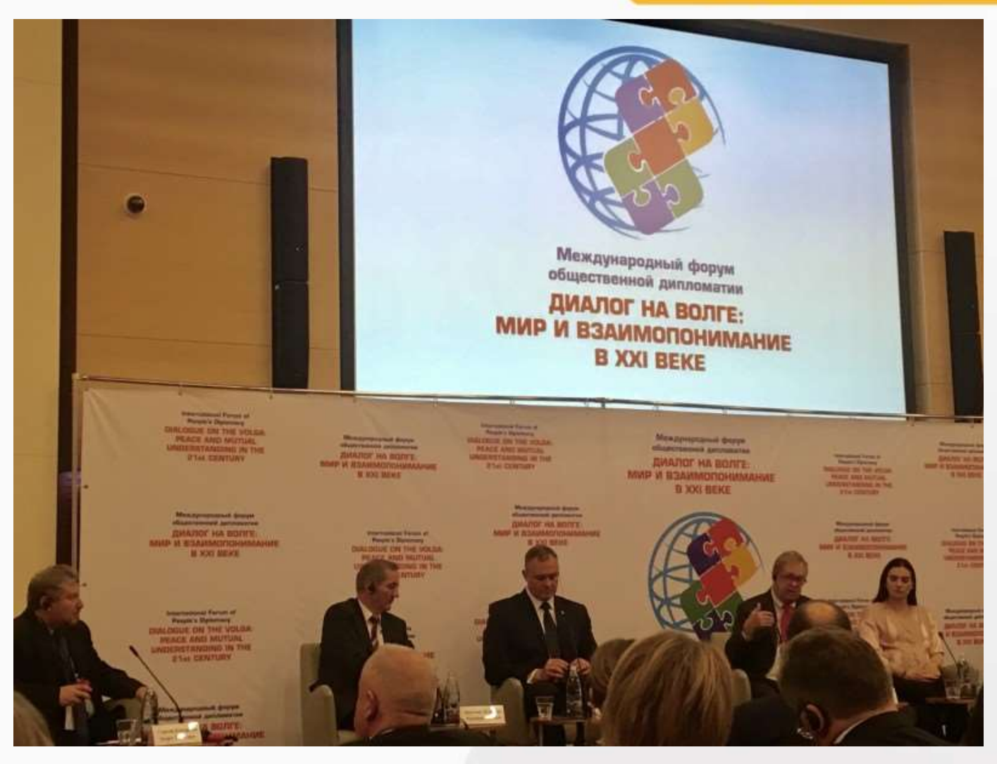
International forum "Dialogue on Volga: peace and mutual understanding in the XX century" (November, 2017)