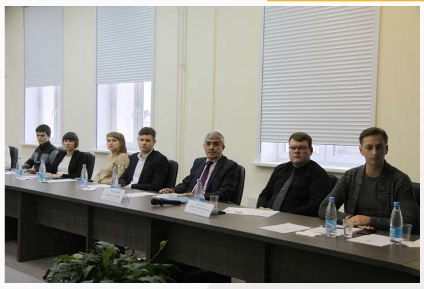
Round table "Public diplomacy in the modern world: youth in the peacemaking process and international cooperation" (2017/10/26)