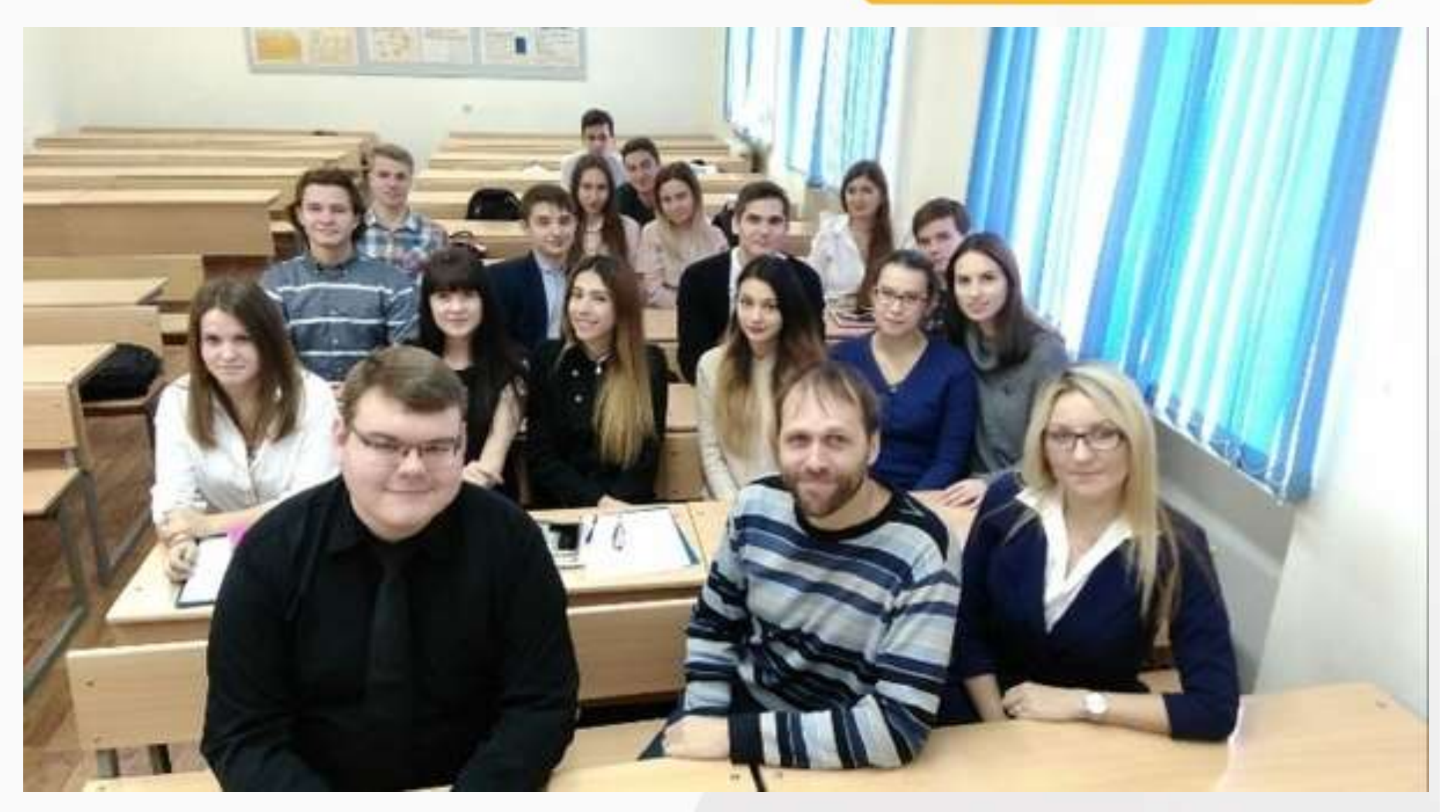
Assembly of Volgograd State University International Discussion Club (2017/15/11)