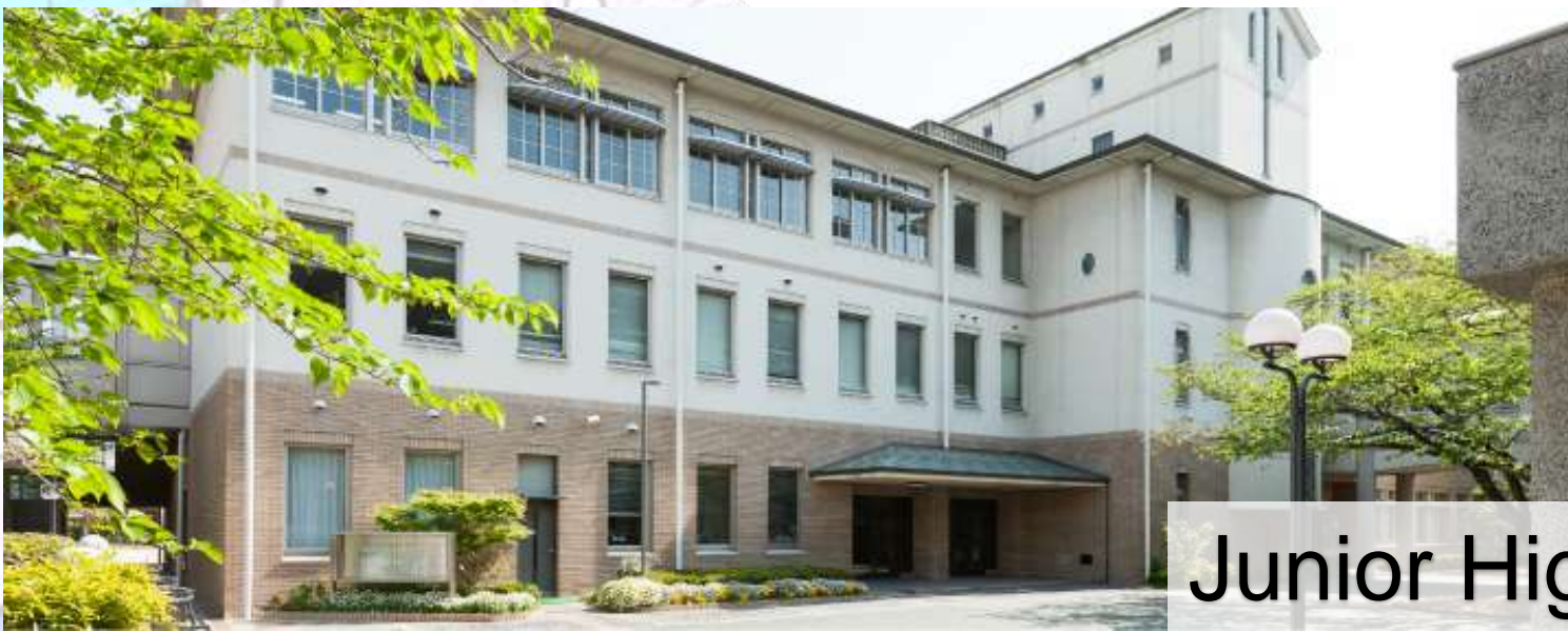
Junior High School