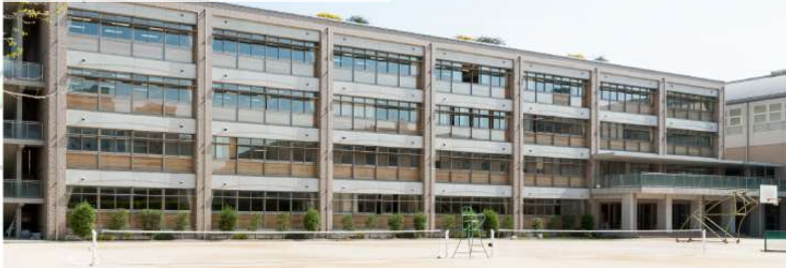
Senior High School