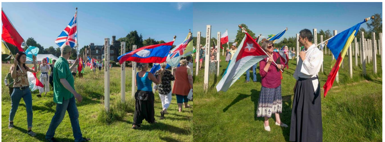
Then it was outside in the glorious sunshine where the flags were taken down to the peace pole 'henge' of 200 peace poles representing every country in the world for more positive affirmations and friendship.