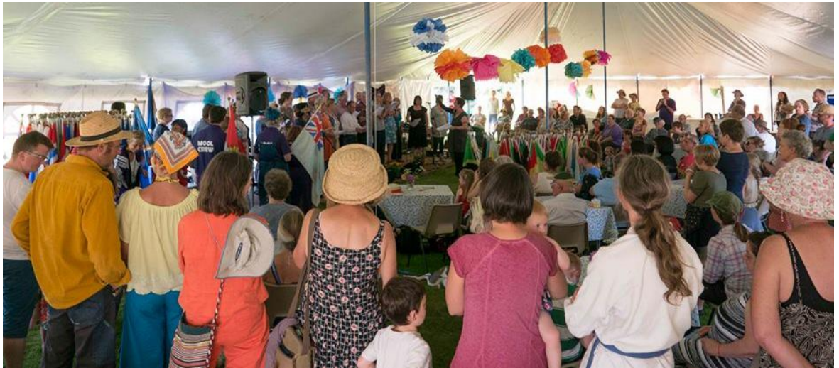
First the flags of the world were paraded in succession in the marquee with participants saying in unison 'may peace prevail in (the name of the country)'.