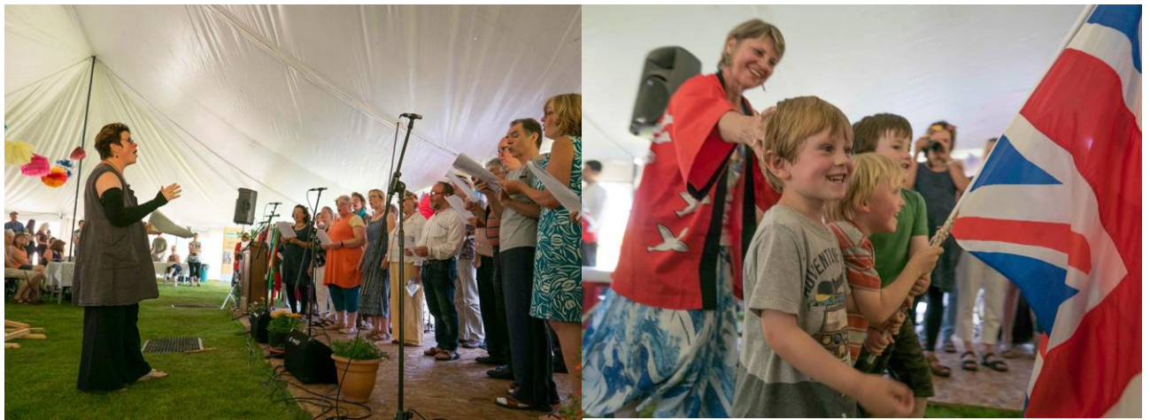
After the flags of each continent had been paraded, the assembly was serenaded by the Allanton Peace Choir, before we ended with Europe and the United Kingdom.