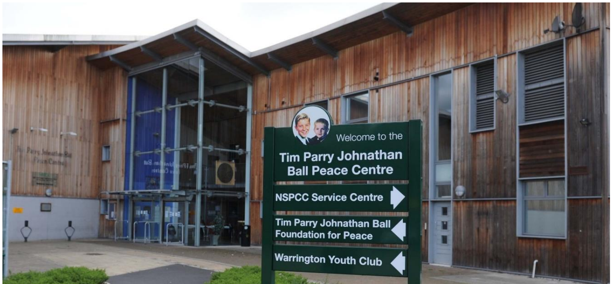
Above: Photo of the Warrington Peace Centre named after the two young people tragically killed in the 1993 IRA bombing in the town centre.

"Warrington is associated with Peace in so many ways that it seemed strange that Oldham were making this request especially as they had been so inspired by what we have achieved over recent decades."