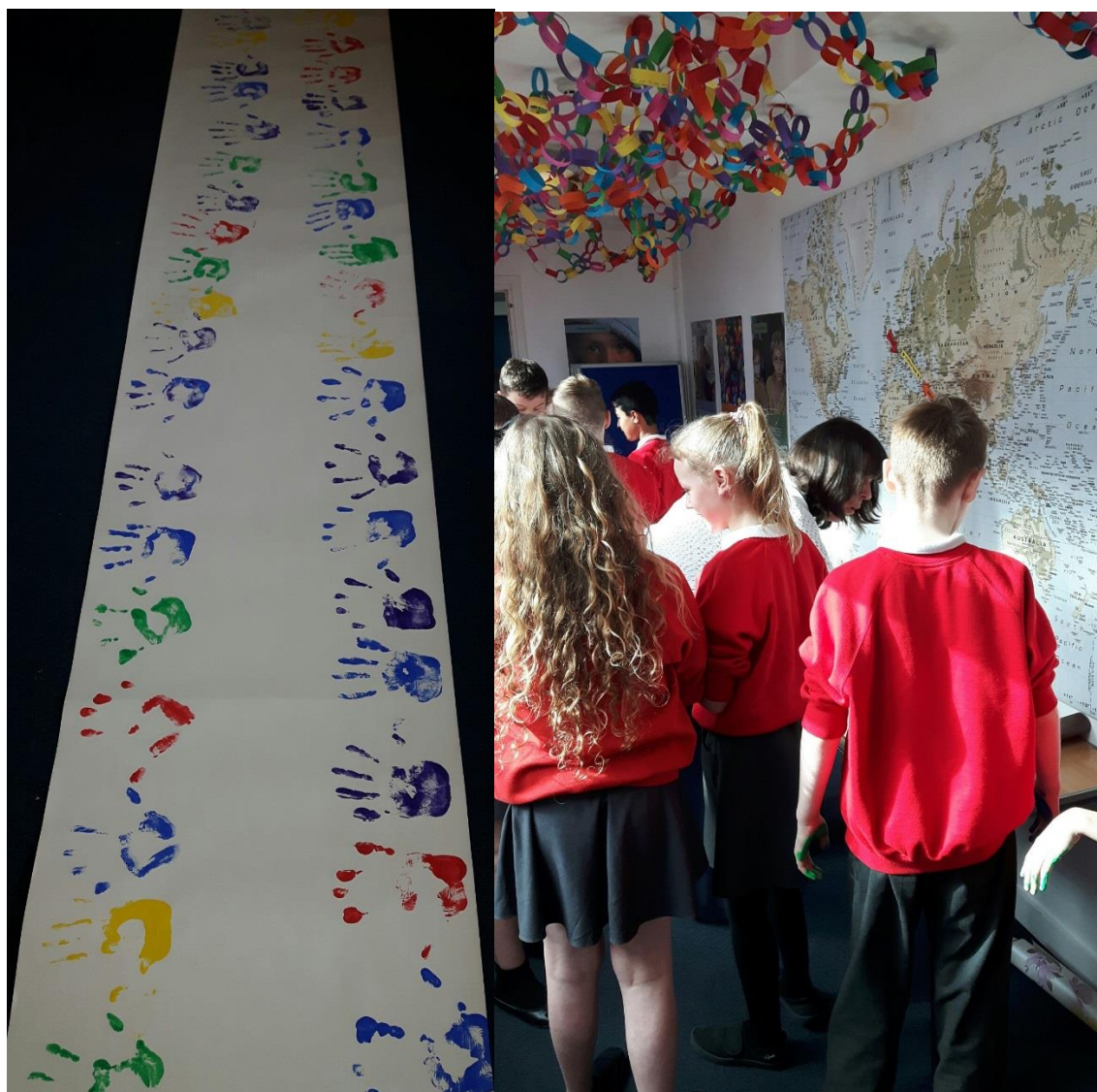
Photos: A sample of handprints (left), Pupils queuing to mark their mark (right)

A special assembly was held and approximately 800 handprints were collected that will be sent to the charity Postcards to Peace, which has launched the Reach Out to Syria appeal ( http://www.reachouttosyria.com/ ).