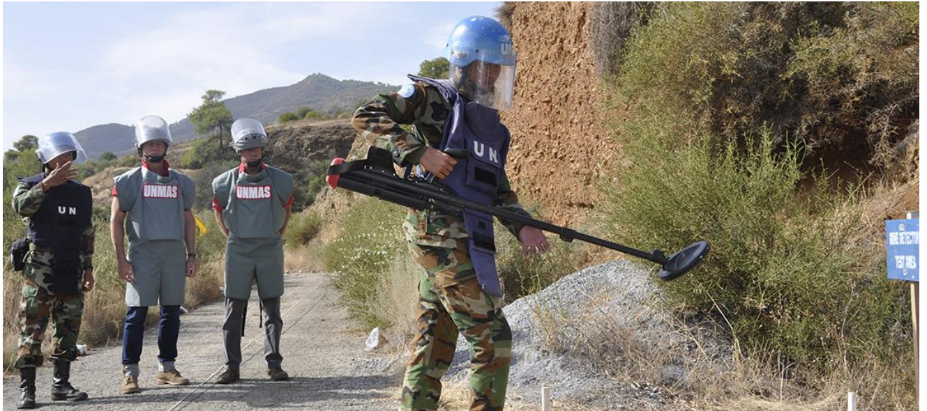
Photo above: The actor Daniel Craig (second left), the UN Global Advocate for the Elimination of Landmines, inspecting work to clear landmines in Cyprus

On 8 December 2005, the General Assembly of the United Nations declared that 4 April of each year shall be observed as the International Day for Mine Awareness and Assistance in Mine Action.