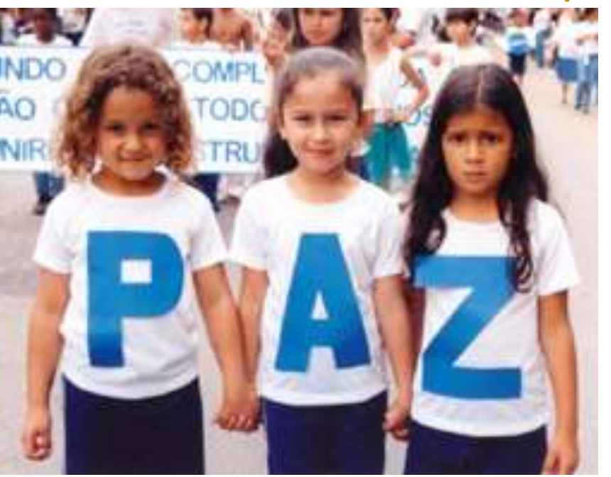
Children participating in educational workshops and events about peace