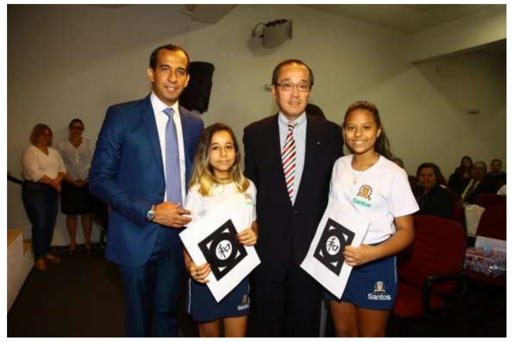
Mayor of Santos during the honorable visit of Mr. Kazumi Matsui, Mayor of Hirshima, to Santos (2015)