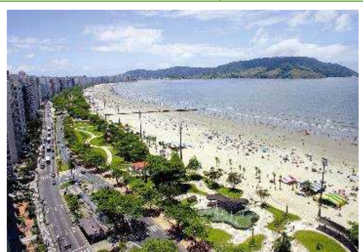
Santos beach and gardens