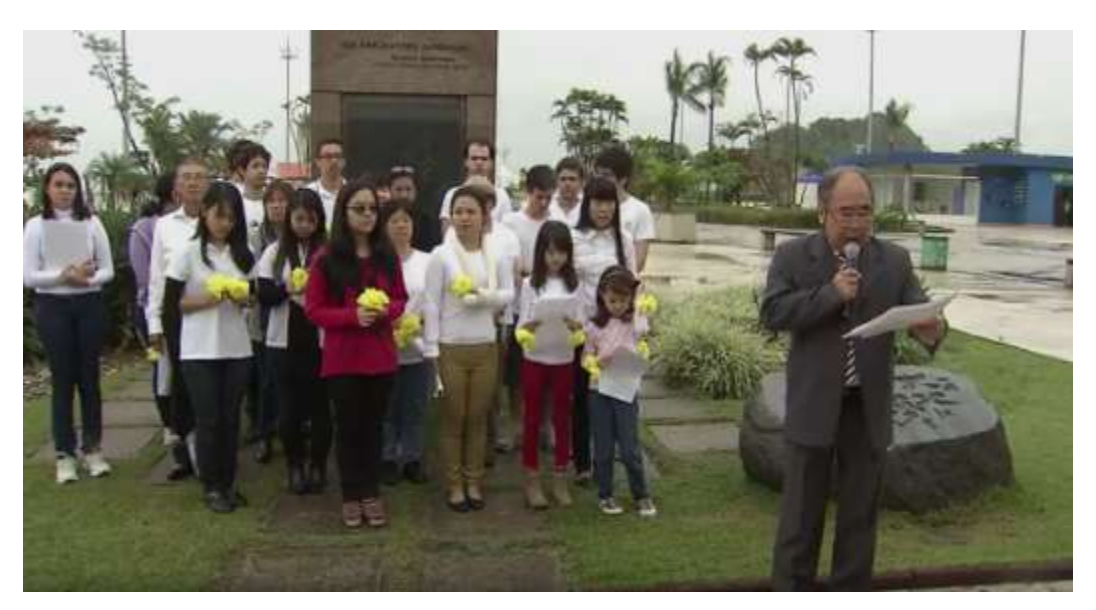
Japanese comunity authorities and population participate in the cerimony in 2015