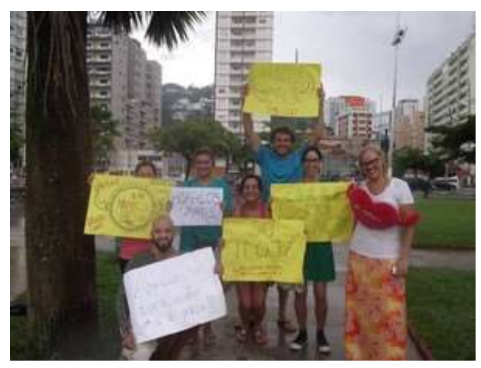
Free Hugs initiative in Santos city