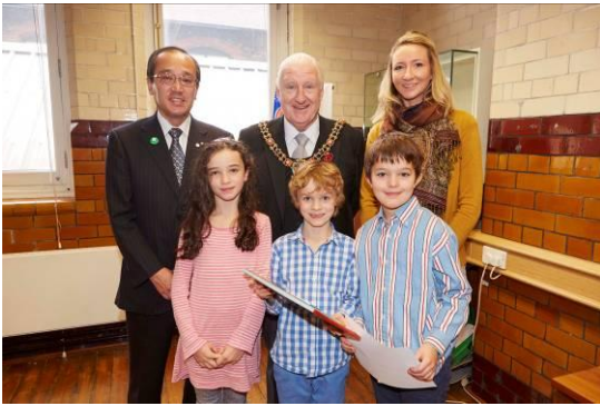
Mayors of Hiroshima and Manchester with a teacher and students of Birchfield Primary School, who took part in Project G