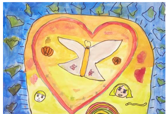
A winning entry in the Project G competition