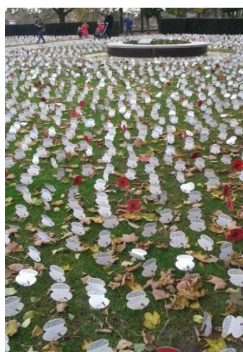
Red and white poppies with personal messages from families of war veterans lay by the Ypres peace memorial on the Ypres Ramparts, above the Menin Gate.