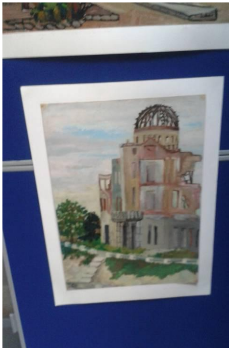
1950's Hiroshima schoolchildren's art in Manchester Town Hall