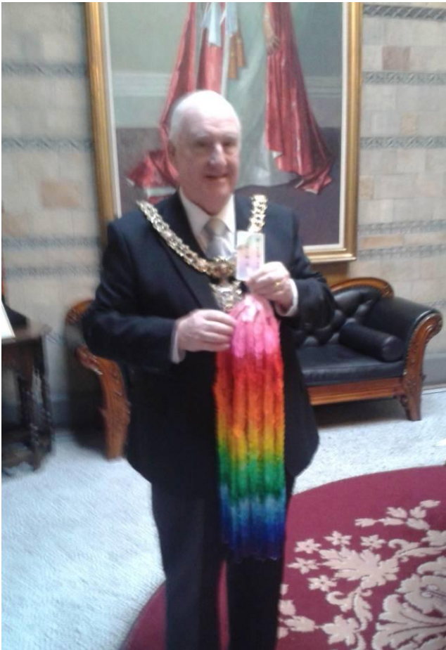
Lord Mayor with Hiroshima peace crane garland