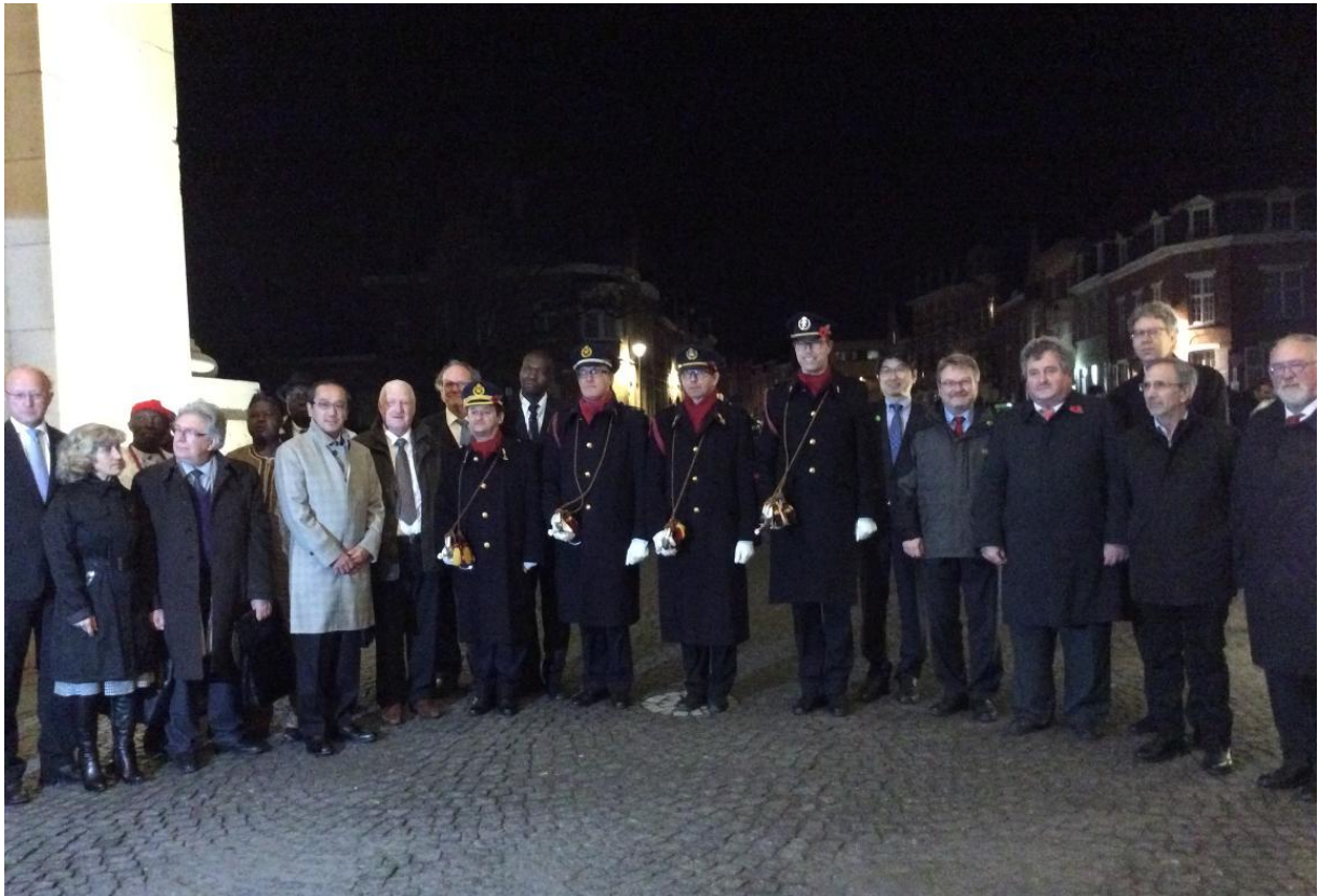
Members of the Mayors for Peace Executive Board with the buglers of the Last Post Society, Menin Gate, Ypres