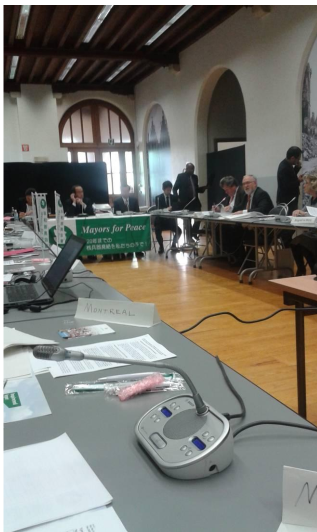
The Mayors for Peace Executive Conference taking place in Ypres