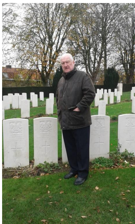
The Lord Mayor of Manchester in front of graves of Manchester soldiers from the First World War, Ypres Ramparts