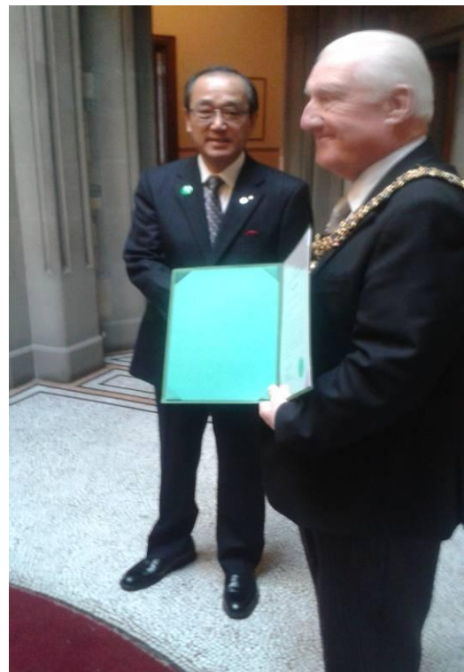
Mayor Matsui presents certificate of thanks to Lord Mayor Murphy, Manchester Town Hall