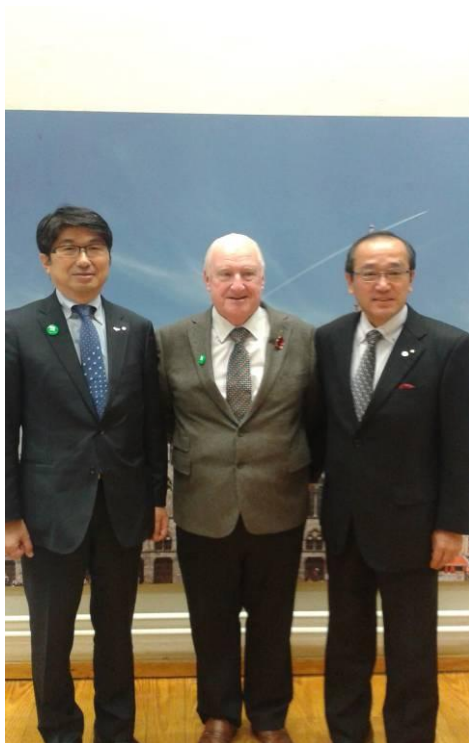
Mayor Taue of Nagasaki, Lord Mayor Paul Murphy of Manchester and Mayor Matsui of Hiroshima at Executive Conference. Ypres