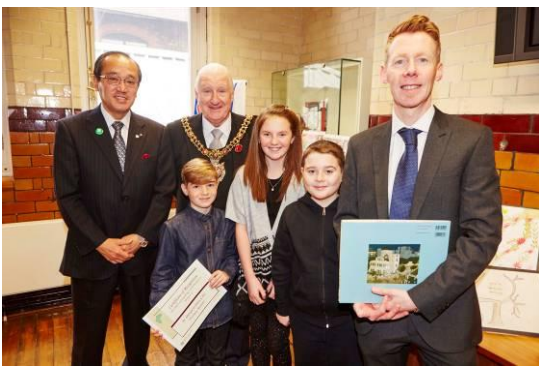
Mayors of Hiroshima and Manchester with teacher and students of St Margaret Mary Primary School, who took part in Project G