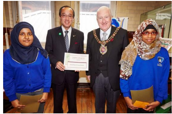
Mayors of Hiroshima and Manchester with teacher and students of Heald Place Primary School, who took part in Project G