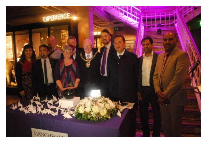
The Lord Mayor of Manchester with three MEPs, five councillors and the Registrar of Manchester University at Hiroshima Day commemoration ceremony