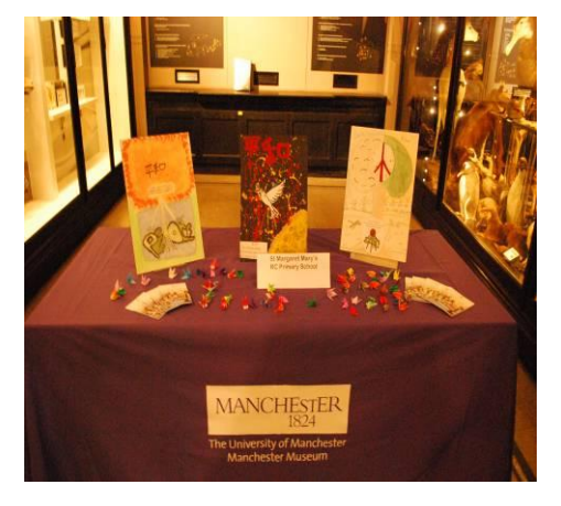
The winning 'Project G' entries from St Margaret Mary Primary School with some Hiroshima paper cranes and copies of the Manchester Peace Trail