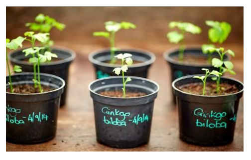
Some of Manchester's gingko biloba trees