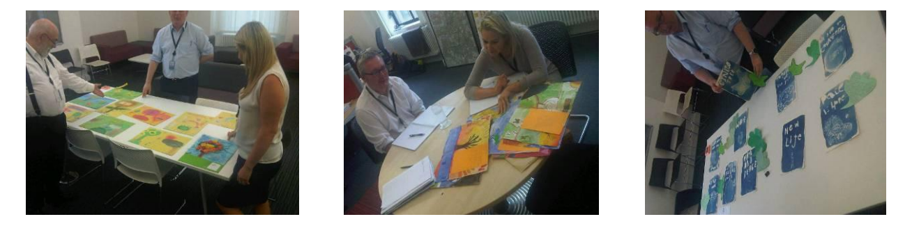
Shortlisting some of the 140 entries from six Manchester schools taking part in 'Project G'

A shortlisting process took place to get 3 winning entries from each school, which could be exhibited on 6<sup>th</sup> August 2015, the 70<sup>th</sup> anniversary of the Hiroshima atomic bombing.