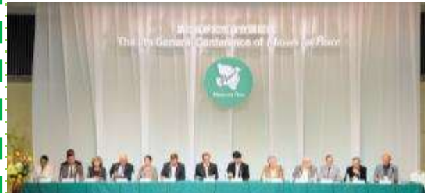
Representatives from Executive Cities at the Press Conference after the General Conference