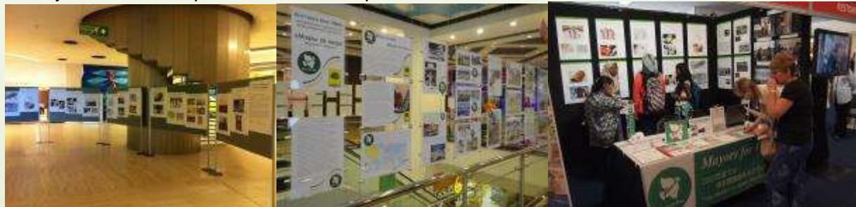
From left to right, poster exhibitions in Geneva (Switzerland), Lipetsk City (Russia) and Sydney (Australia)

Based on the decisions at the 8th General Conference of Mayors for Peace in August 2013, we have updated a part of the Mayors for Peace A-bomb posters. In this section, we would like to show you some examples of the A-bomb posters exhibitions held in 2013.