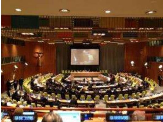
The High-Level meeting of the UN General Assembly on Nuclear Disarmament

He also met with representatives of major NGOs such as International Campaign to Abolish Nuclear Weapons (ICAN). He explained future activities of Mayors for Peace and exchanged opinions on further cooperation with them.