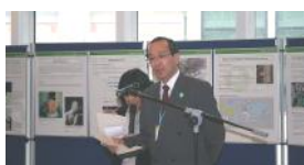
Mayor Matsui speaking at an official opening ceremony for the poster exhibit in Vienna International Center

This exhibition started at the Vienna International Center building and at the Vienna City Hall in May 2012 along with the first Preparatory Committee Mayor Matsui speaking at an official opening ceremony for the poster exhibit in Vienna International Center