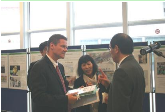
Mayor Matsui, President of Mayors for Peace, submitting signatures collected in the petition drive calling for a nuclear weapons convention to Chairman Peter Woolcott of the NPT PrepCom

In May 2012, Mayors for Peace delegates (32 people from 13 cities in 9 countries) participated in the first Preparatory Committee Meeting for the 2015 NPT Review Conference, which took place in Vienna, Austria. Speaking at the NGO session, holding a workshop, and talking informally with ambassadors and UN officials, the delegates communicated messages from Hiroshima and Nagasaki, requesting greater efforts for the abolition of nuclear weapons. They also requested support for Mayors for Peace activities and invited the NPT Review Conference to Hiroshima.