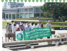
Event in Hiroshima

The United Nations has called for suspending hostile activities on International Day of Peace, September 21, as a global day of ceasefire and non-violence. In support of the aim of the day, an event commemorating this day was held to pray for peace, and to observe one minute of silence in our member cities around the world, such as Hiroshima, Nagasaki, Kashiba, Matsue and Tokaimura of Japan; Kabul, Afghanistan; Auckland, New Zealand; Nairobi, Kenya; Theewaterskloof, South Africa; Dublin, Ireland; Bagheria, Italy; Amsterdam, Netherlands; Geneva, Switzerland; Manchester, UK; Montreal, Ottawa and Winnipeg of Canada; Albany, Ashland, Boston, Chicago and Philadelphia of USA and Campo Grande, Brazil.