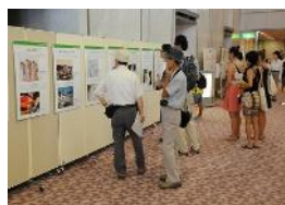
Poster exhibition in Hiroshima, August 6, 2012

As of April 1st, 2013, more than 250 cities around the world have held the poster exhibition. Thanks to the translation by executive cities and other supporters, the posters are available in Spanish, Catalan, English, French, Dutch, German, Russian and Japanese.