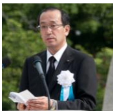
MATSUI Kazumi, Mayor of Hiroshima

Following Hiroshima's mayoral election on April 10, 2011, Mr. MATSUI Kazumi, the new Mayor of Hiroshima, assumed the office of Mayors for Peace president. We humbly ask your continued support and guidance under our new leadership.