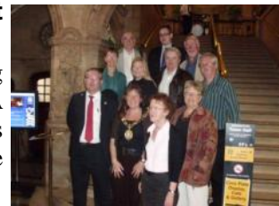
Joint Seminar in Oxford

Hosted by the Lord Mayor of Oxford, the UK Mayors for Peace Working Group held a business meeting, followed by a joint seminar with the NFLA English Forum in Oxford, UK. At the business meeting agreement was achieved on a joint letter to recruit new members and a UK tour for the Hiroshima-Nagasaki A-bomb exhibition.