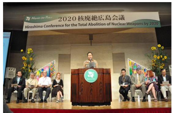
Reading out the Hiroshima Appeal