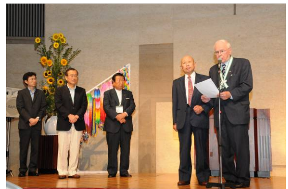
Presenting the Honorable Douglas Roche, O.C., with the Hiroshima City Special Honorary Citizenship