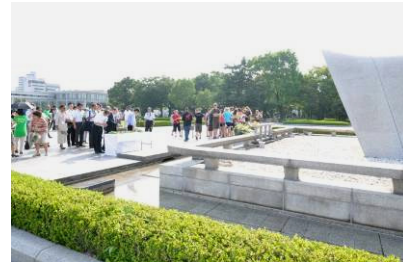
Offering flowers at the Cenotaph