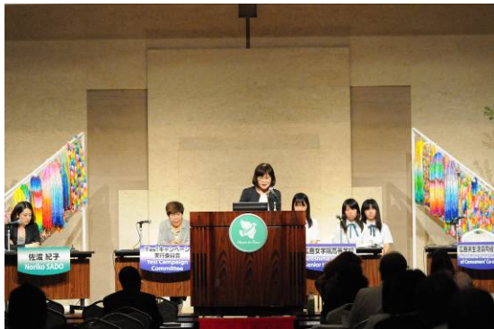
Hiroshima Prefectural Federation of Consumers' Co-operative Union