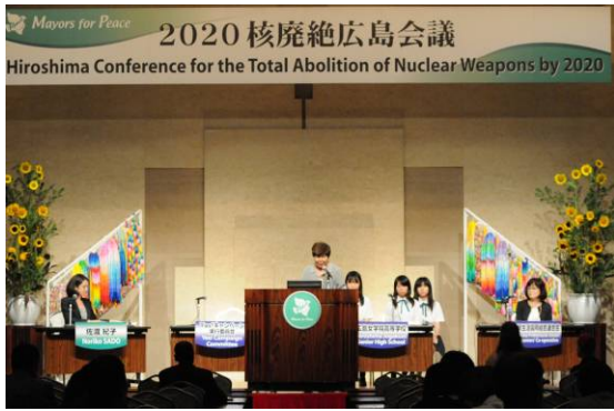
Executive Committee of Yes! Campaign