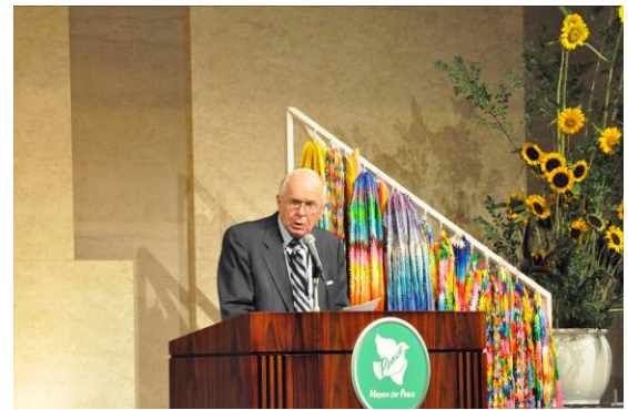
Lecturer: The Honorable Douglas Roche, O.C., Chairman Emeritus of the Middle Powers Initiative