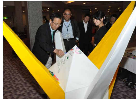
Mayor Akiba of Hiroshima writes a message on a paper crane portable shrine