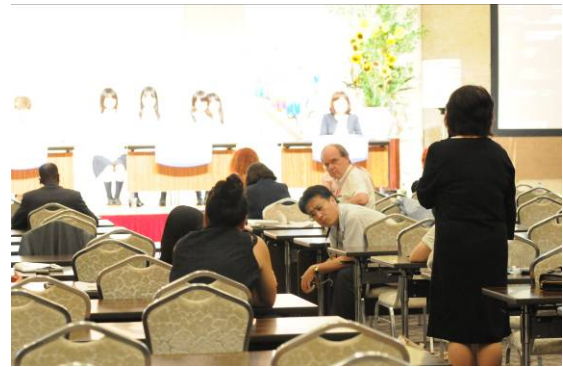
Statements from the floor