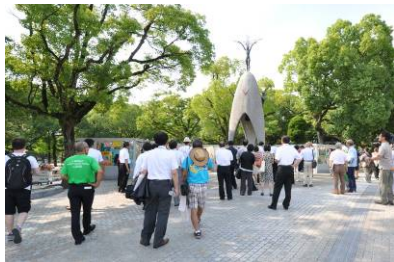
Peace Memorial Park