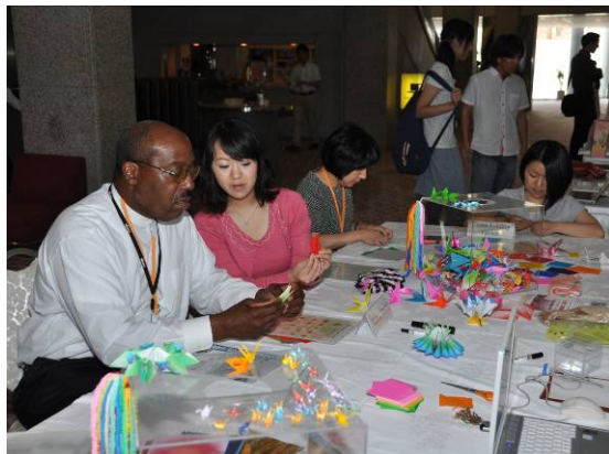
Participants making paper cranes