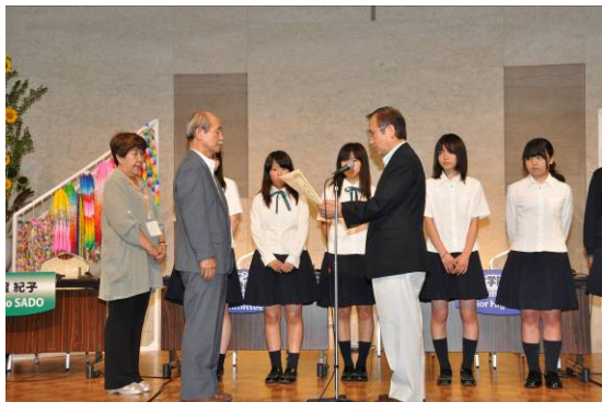
Presenting a letter of appreciation to the citizen groups for their activities