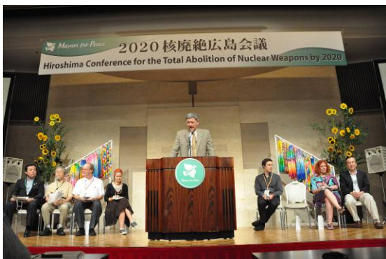
Report from a member of the Appeal Drafting Committee