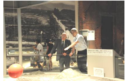
Hiroshima Peace Memorial Museum