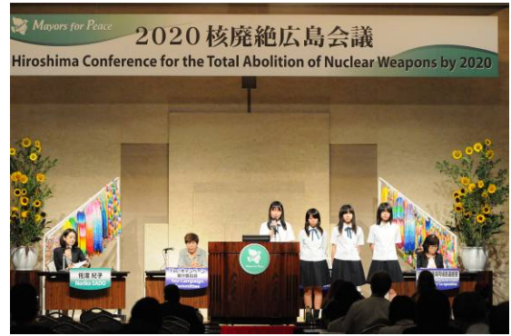
Hiroshima Jogakuin High School