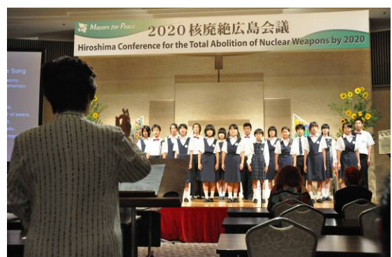
Pueri Cantantes and Hiroshima Junior Chorus