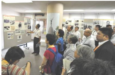
Paper Crane Exhibition (Former Municipal Baseball Stadium)