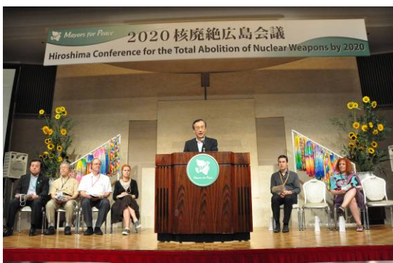
Closing remarks by Mayor Akiba of Hiroshima