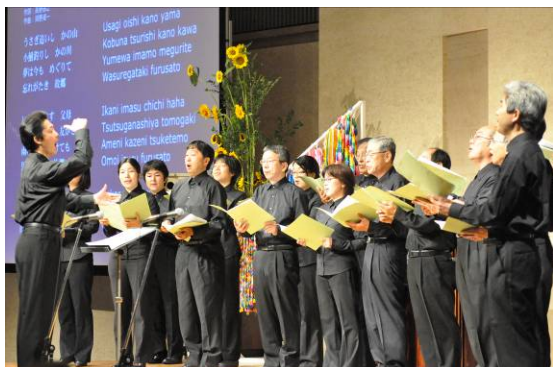
Hiroshima City Hall Choir