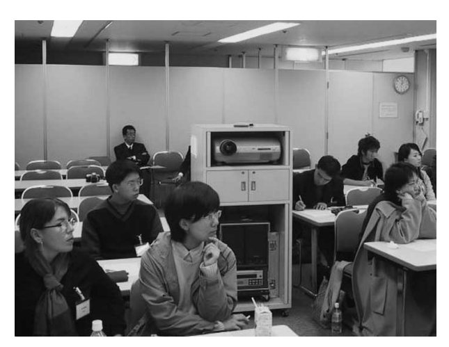
Participants listening intently to the lecture

Six students studying at ICU on Rotary Club scholarships visited Hiroshima from April 5 to 7,2003. Along with 15 students from Hiroshima they heard A-bomb testimony, listened to lectures about the physical and medical effects of the A-bomb, watched an A-bomb documentary film, then toured Peace Memorial Park and the museum. These experiences helped them confront the reality of the atomic bombings. Later, they took part in a lively exchange of opinion regarding peace and current international relations with researchers at the Hiroshima Peace Institute.