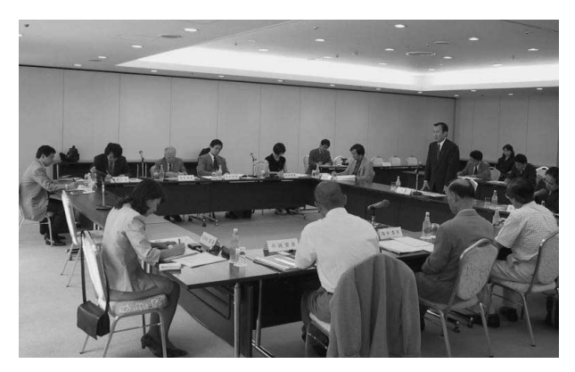
First Research Conference