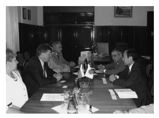
Visit for Volgograd State Technical University in Russia

September 3 to 10, 2002, Hiroshima's mayor visited Lomonosov Moscow State University and Volgograd State