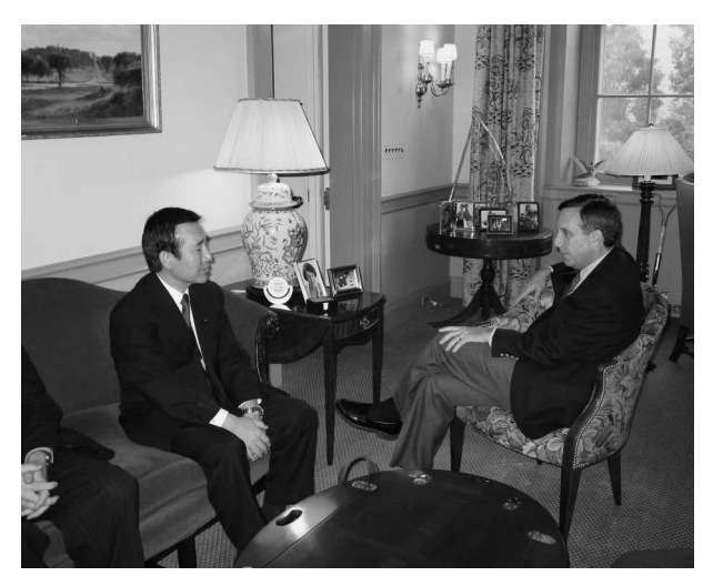
Visit to Tufts University in the USA

In addition, on October 15, 2002, the mayor visited Tufts University (USA), met with the president and requested assistance. He received a commitment of full support and help with such aspects as a high-speed communication network.