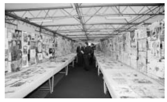
The hall exhibiting drawings by children from around the world

Under the theme of the late Mother Teresa's words: "Twinship: a Peace Gesture," the Italian city of Forli held the "Third International Art Contest for Young People" from May 15 to 25, 1998, as part of "Europe Week." The city's central plaza was brightened by the 2,535 children's painting on display.