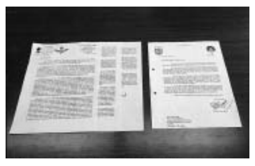
Response letters from India and Pakistan