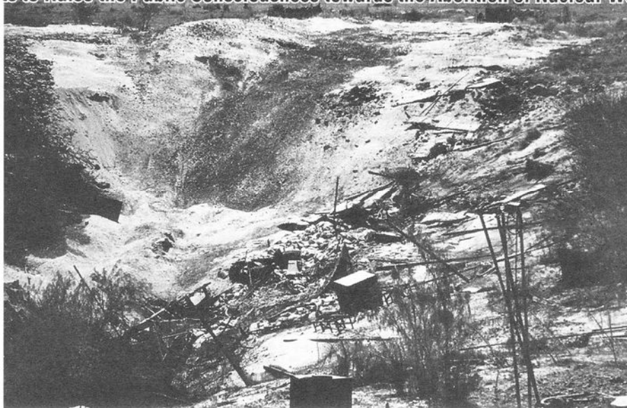
Nuclear test site in Pokaran, India (May 11, 1998)

Continued Efforts to Raise the Public Consciousness towards the Abolition of Nuclear Weapons are vital