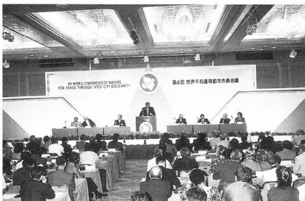
The mayor of Wollongong, David Campbell delivering an address during the closing ceremony.