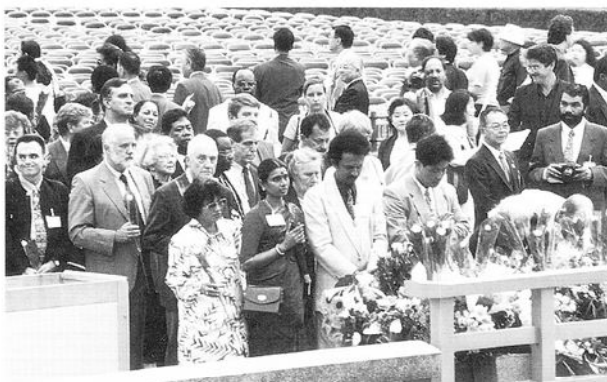
Before the opening ceremony; participants dedicating flowers at the Cenotaph for the A-bomb Victims (August 5, Hiroshima)