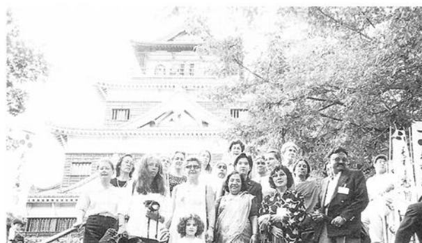
Commemorative photo taken in front of Hiroshima Castle. (Spouse program in Hiroshima)

We hope we will all continue to do our best to widen the circle of solidarity for peace.