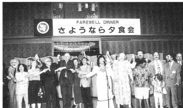
Participants deepening their exchange (Farewell Dinner, August 9, Nagasaki)

At the closing ceremony, which took place at 3:30 p.m. August 9, the participants unanimously adopted the Hiroshima-Nagasaki Appeal (see page 5), bringing down the curtain on this 4th Mayors Conference.