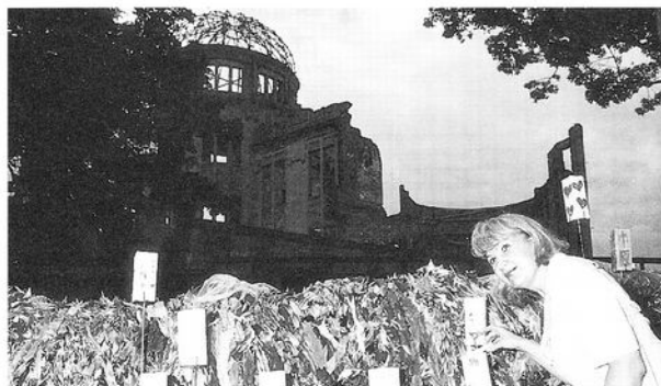
At the Peace Candle Service held the evening of August 6, candles made by the children of Hiroshima and inscribed by conference participants, the children, and others, filled the area around the A-bomb Dome with light and messages of peace.