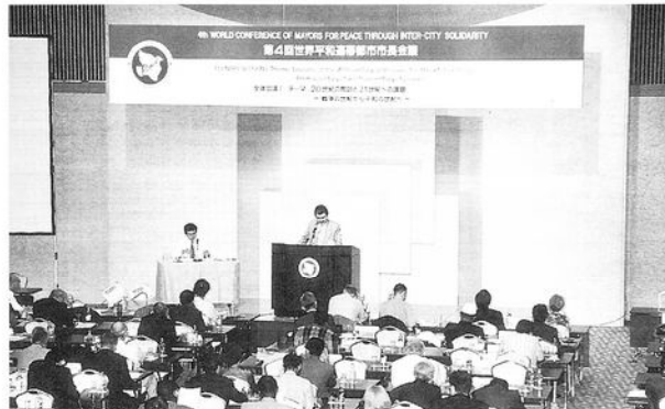
Plenary Session I