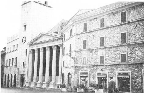
Assisi City Hall, the exhibition venue

From March 1 to 31, a Hiroshima-Nagasaki Atomic Bomb Exhibition is being held in Perugia and Assisi Cities in the state of Umbria, Italy. This exhibition is being sponsored by the state of Umbria, the Perugia Administrative District, Perugia City, Assisi City and the Association for Peace with support from cities of Hiroshima and Nagasaki.