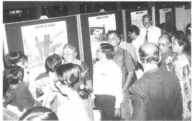
Hiroshima-Nagasaki A-bomb Poster Exhibit in Madras