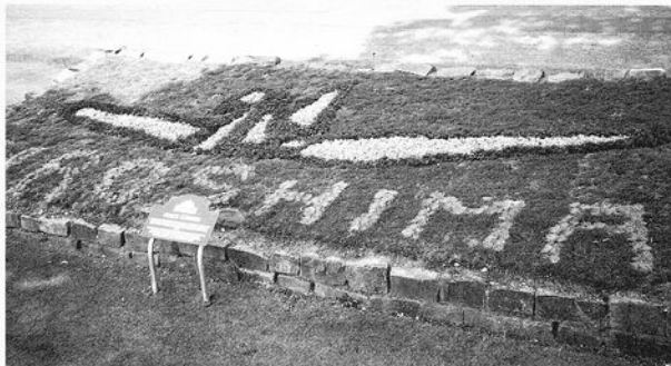
UN. Hiroshima Peace Garden in Brighton, United Kingdom

As the largest most popular seaside resort in southern England, Brighton is also known as a city of peace. Peace is the theme in many of Brighton's parks. Along the main route in Brighton, a United Nations International Peace Garden is the center of our acclaimed Garden of Greetings. Last year Geneva provided the floral design while Yokohama, Japan gave their design the previous year and New Haven, Connecticut in the U.S.A. gave theirs the year before. This year, the new peace garden was designed by the city of Hiroshima, having a "paper crane" as its motif, and is being enjoyed by Brighton's citizens.