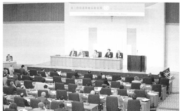
Opening ceremony of the 2nd United Nations Conference on Disarmament Issues

In Plenary V, on the last day of the conference, Prvoslav Davinic, Director of the United Nations Centre for Disarmament Affairs, made a closing statement that included five elements: (1) The CTBT Treaty must be carried out; (2) Materials used in nuclear weapons must be eliminated; (3) Nuclear weapons must be abolished; (4) His personal support