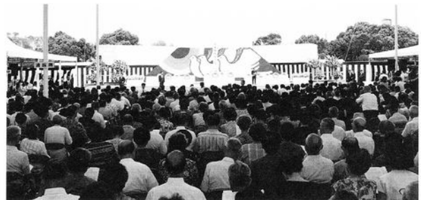
49th Nagasaki Peace Ceremony