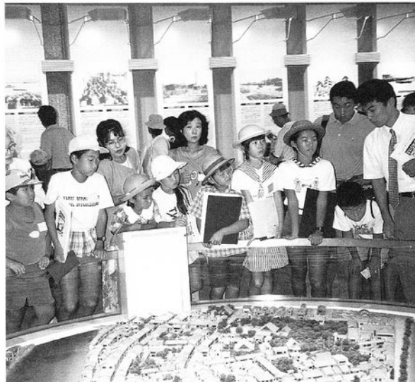
Children studying about peace in the East Building of the Hiroshima Peace Memorial Museum

Visitors enter at the renovated entrance of the East Building, move through the entrance building past the ticket sales area, through the exhibition room on the first floor and the exhibition rooms on the second and third floors, then through the passageway between the two buildings, ending up in the West Building of the Hiroshima Peace Memorial Museum.