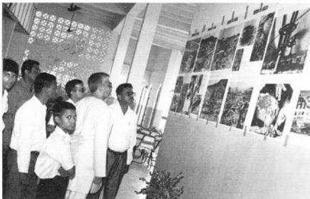
Peace Poster Exhibition Siddharthanagar Nepal

In connection with this cause, the Siddharthanagar Municipality opened an exhibition of peace-related posters on the November 4, 1993. Visitors to the poster exhibition numbered in the thousands, and the event left a lasting impression on all.