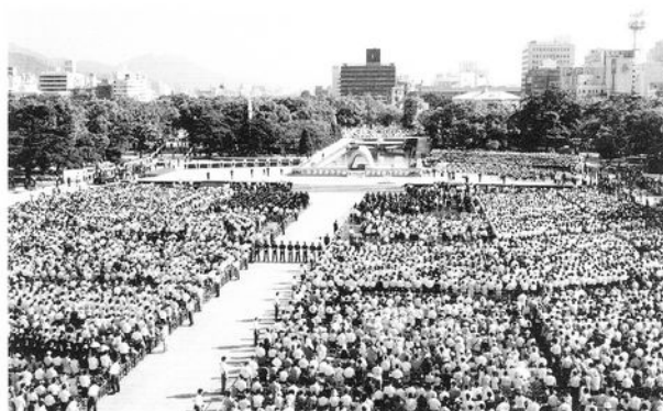
49th Hiroshima Peace Memorial Ceremony