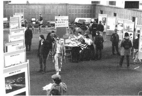
Hiroshima-Nagasaki Memorial New York State Cornell University U S A

Despite a heavy snowfall on the second day, nearly a thousand people attended the poster exhibition starting at 10:00 am and lasting until 4:00 pm. For many of the guests, viewing the atomic bomb-related materials seemed to be a new experience and a time for reflection. In the future, the society hopes to continue its public awareness campaigns and will surely meet with continued success.