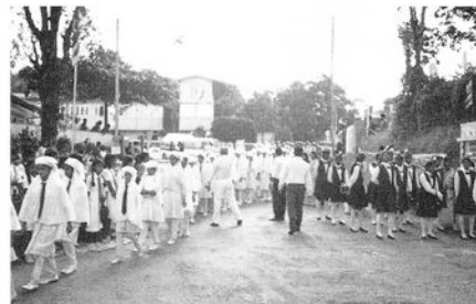
Peace Procession Bandarawela Srilanka

Before the opening of the exhibition, a peace procession including the Bandarawela police force marched to the library to liven up the occasion