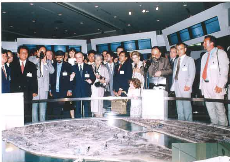
Tour of Hiroshima Peace Memorial Museum