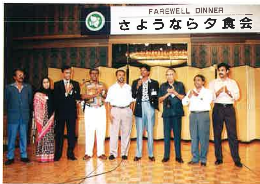
Participants singing traditional songs from their countries