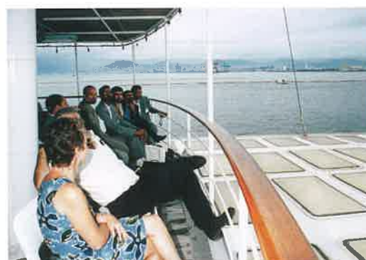
Enjoying the beautiful scenery of the Inland Sea