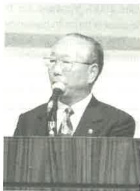
Mayor Yamashita of Hatsukaichi