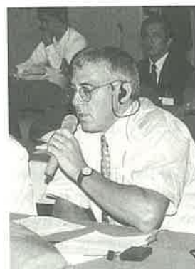
Deputy Mayor Bezoville of Nanterre

In the United Nations General Assembly, the issue related to France was pointed out. Listening to the discussion today, I would like to give my supplementary comments.