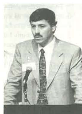
Mayor Erkal of Malatya

Afterwards, the idea of peace will be carried out to all, and the struggles of people to