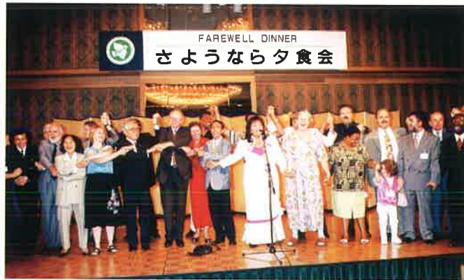
Having got to know each other well during the conference, participants exchange friendship and make the farewell dinner very successful.