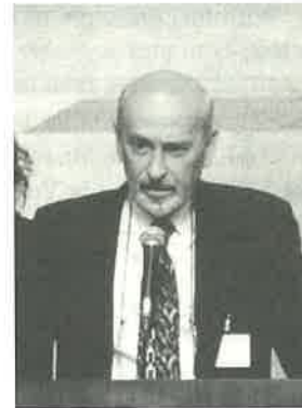
Deputy Mayor Villani of Como

The quantity of atomic weapons built up through the years is huge, in terms of destructive capacity, and the dismantling process requires so much time and money that some countries cannot afford it. Like the problem of a nuclear war, the problem of a nuclear peace affects the whole of humanity.