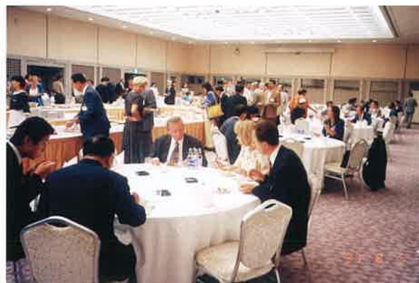
Discussions continue over lunch