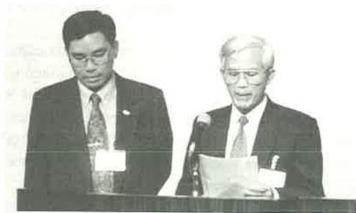
Representatives from Hue

Hue City, which is a World Cultural Heritage Site, has suffered crimes done by the aggressor against the