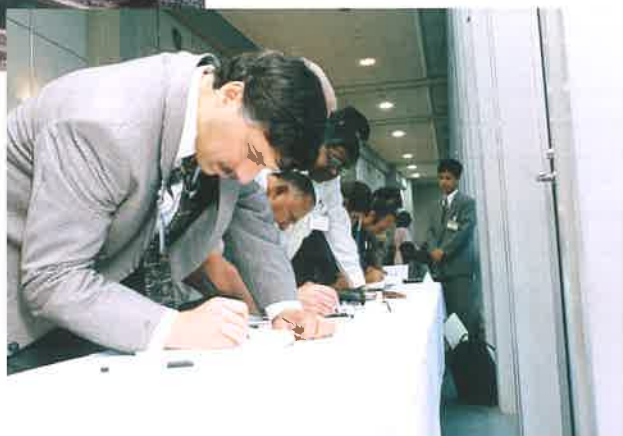
Participants writing down their message on the guest books after the tour