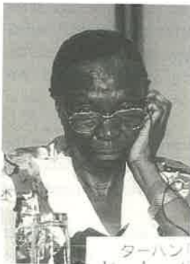
Mayor Mthembu of Durban South Central

Ms. Theresa Mthembu, Mayor of Durban South Central (South Africa): "To have peace in our land,