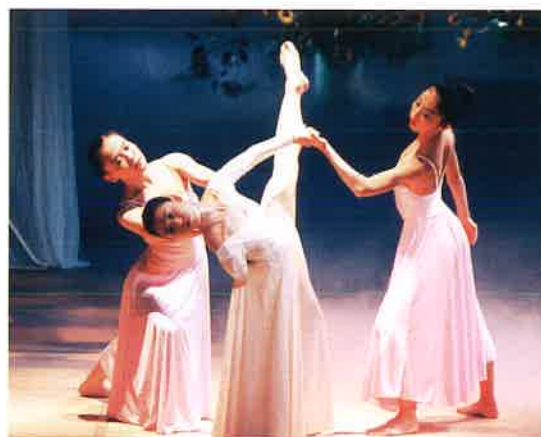
Dance performance "A Melody"