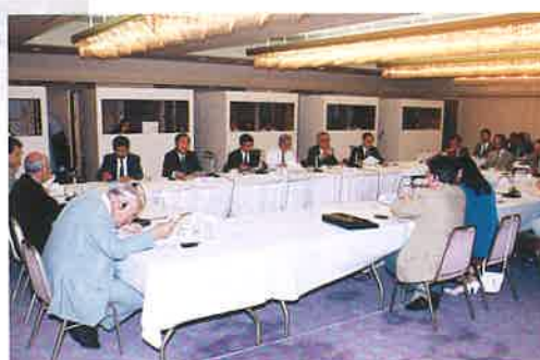
Members of Hiroshima-Nagasaki Appeal Drafting Committee having serious discussions about the appeal until midnight