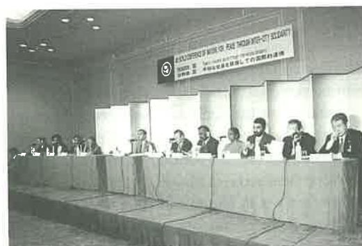
Coordinator and speakers on the stage

Next, I would like to call your attention to the issue of security. In my view, there are three types of security. The first type concerns national defense. National defense policies, often reflecting arrogance