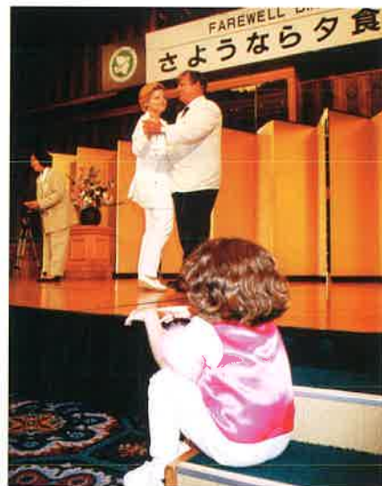
Daughter watching her mother dancing