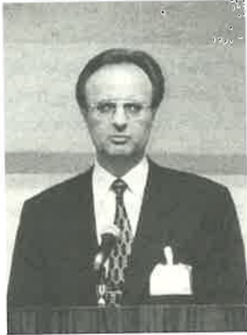
Mayor Kossakivsky of Kiev

Mr. Leonid Kossakivsky, Mayor of Kiev (Ukraine):