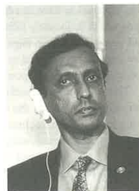
Deputy Mayor Kamil of Colombo

Since the end of World War II, nuclear weapons have not been used in warfare, but the danger to humanity and the environment continues. This is because there is unregulated nuclear testing, manufacture of nuclear weapons, uranium mining, nuclear fuel reprocessing, radioactive waste