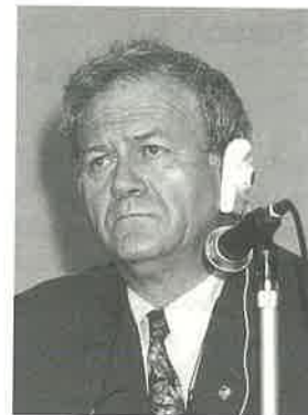
Deputy Mayor Pilet of Angers

Mr. Gerard Pilet, Deputy Mayor of Angers (France): The mayors of Hiroshima and Nagasaki, Ladies and gentlemen; for local governments to maintain and promote international relationships is not a new phenomena. Actually, these efforts have been going on for a long time. Now, on the local governmental level, what has been done? I would like to emphasize sister city relationships.