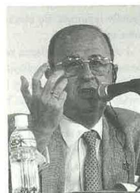
Mayor de Olejua of Gernika-Lumo

The destruction of Hiroshima and Nagasaki is not an independent case of destruction because the atomic bombs were the result of a series of incidents that started in 1937.