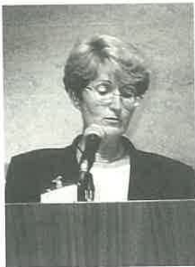
Mayor Fraysse of Nanterre

Ms. Jacqueline Fraysse, Mayor of Nanterre (France): Good afternoon ladies and gentlemen: My