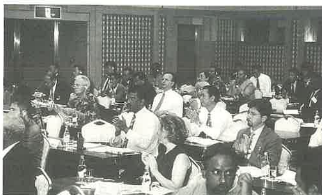
Participants at the Conference

No doubt, this goal is laudable. It is said that shelter, food, and clothing are the three essential things for human beings, but I wish to add one more, that is peace. I would like to emphasize the definition of peace. Pollution, unemployment and the lack of essential commodities disturb one's peace of mind, which in turn disturbs one's mind, which in turn disturbs one's peace in life. Rapid increases in population and urbanization are also required to be considered as major issues. Hence, it is my earnest request to all of you to see that man's intellect will be used constructively in order to solve problems like pollution, the shortage of essential commodities, unemployment, and that man's intellect is not used for destructive