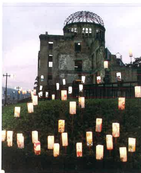
At the Peace Candle Service held in the evening of August 6, candles made by the children of Hiroshima and inscribed by conference participants, the children and others, filled the area around the A-bomb Dome with light and the message of peace.