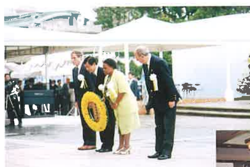
Representatives of the conference participants dedicating flowers at the Nagasaki Peace Memorial Ceremony on August 9, 1997