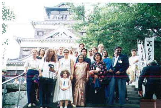
Memorial photo in front of Hiroshima Castle