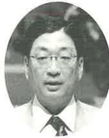
Mr. Yuzan Fujita Governor of Hiroshima Prefecture

I would like to say a few words in celebration of the opening of the 4th World Conference of Mayors for Peace through Inter-city Solidarity.