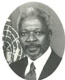
Mr. Kofi Annan Secretary-General of the United Nations