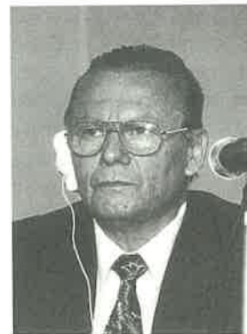
Mayor Schuster of Kosice

The city of Kosice is located in the center of Europe, close to the national border, 100 km away from the Polish border, and 20km away from Hungary. Austria is only 400 km