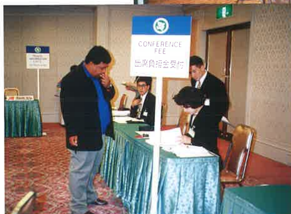
Registration room in Rihga Royal Hotel Hiroshima