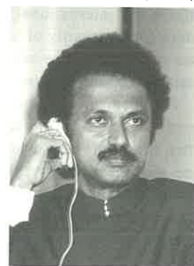
Mayor Stalin of Chennai

Respected Chairperson, distinguished mayors of other great cities of the world, and members of this conference, dear participants, esteemed brothers and sisters: at the outset I would like to congratulate the organizers of the World Conference of Mayors for Peace through Inter-city Solidarity for having organized this