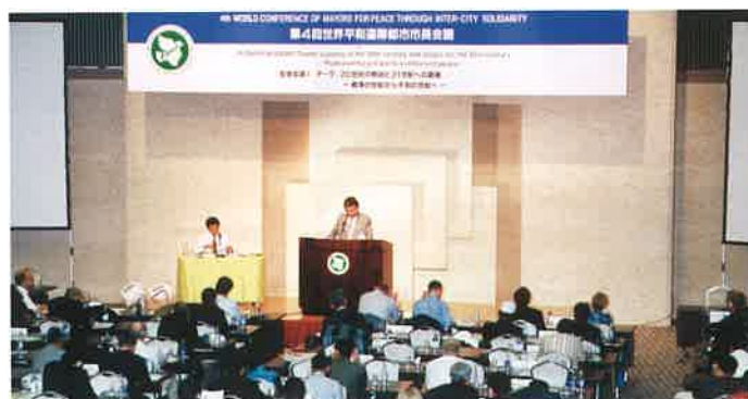
Plenary Session I