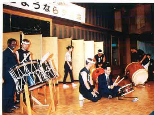
Overseas participants trying out Japanese drums