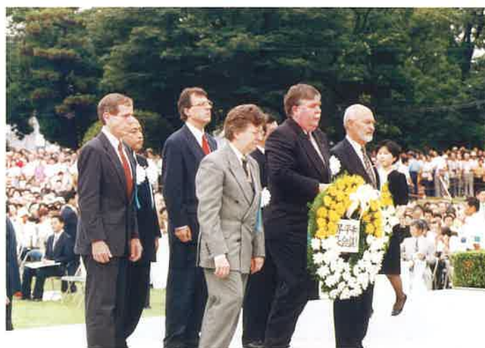
Conference participants dedicating flowers at the Hiroshima Peace Memorial Ceremony on August 6, 1997