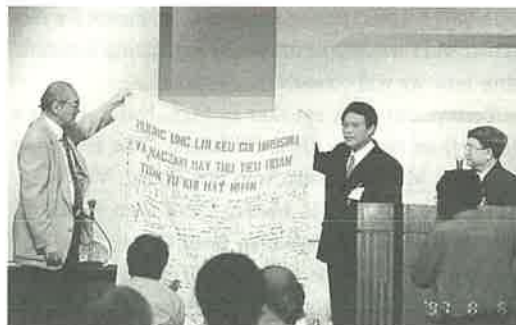
Representatives from Hai Phong introduce a flag signed by 600 people for peace

Before coming here, we organized one blessing ceremony in Hai Phong at which 10,000 people attended, and now we deliver this flag to you with 600 of our people's signatures on it as a sign of peace.