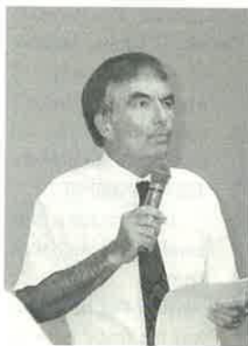
Deputy Mayor Fontaine of Aubagne

experiences, people can consider how they can contribute to the promotion of peace. I think this conference is very important, so that we can share the experiences of many cities. In the World Conference of Mayors for Peace through Inter-city Solidarity, we can share the initiatives and leadership that has been taken by other cities.