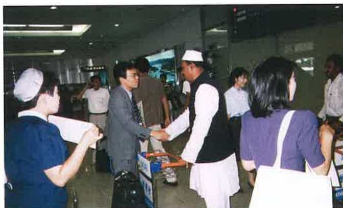
Secretariat staff meeting overseas participants at Hiroshima Airport