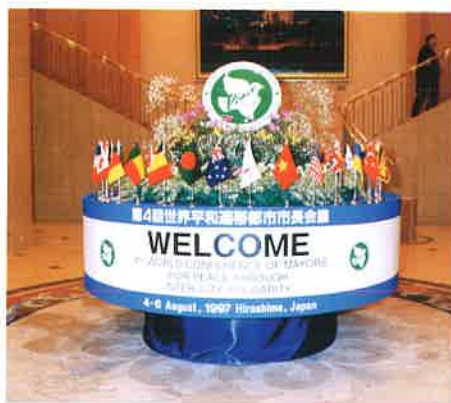
Welcome monument at the hotel lobby