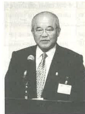
Mayor Arakawa of Okinawa

Among the presentations already given today, some were given by representatives from very large cities. In total Okinawa Prefecture has a population of 1.2 million people, however Okinawa City only accounts for a fragment of that entire population, as we are a small city with a population of 115,000 people. So, compared with these other cities, Okinawa is relatively small in size.