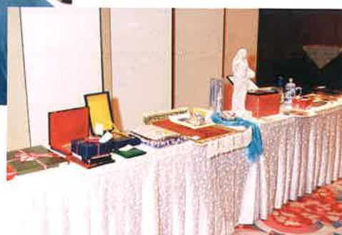
Gifts from overseas participants