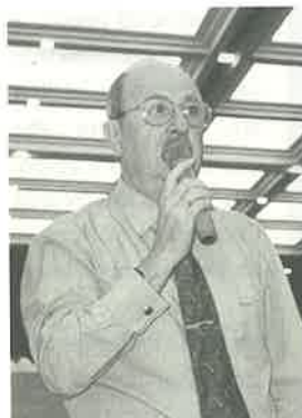
Mayor de Olejua of Gernika-Lumo

bombed and attacked by Franco as well. Picasso made a painting of Gernika, and Gernika is famous because