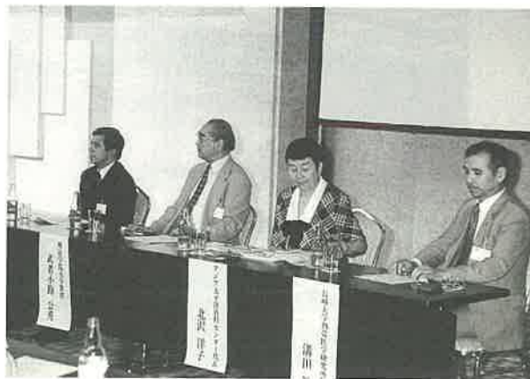
Introduction of coordinators

Kindly return your headset to the reception desk. Thank you very much. Now, the session is adjourned for lunch. Thank you.