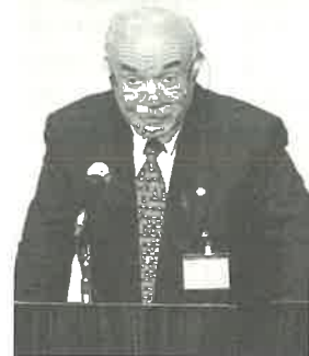
Mayor Saker of Bursa

My name is Erdem Saker. I am the mayor of the metropolitan city of Bursa, which is the fifth city in Turkey with 1.5 million inhabitants. I would like to make my speech on behalf of my city, as the mayor, and also on behalf of two international organizations: IULA, International Union of Local Authorities, and ICLEI, International Council