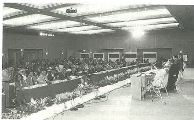
Discussion with Atomic Bomb Survivors

Thank you very much for coming and for your kind participation.