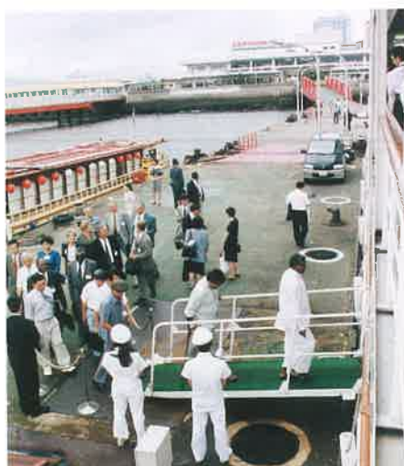
Participants boarding the cruising ship "Ginga"