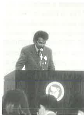
Mayor Stalin of Chennai

Mr. M. K. Stalin, Mayor of Chennai (India):