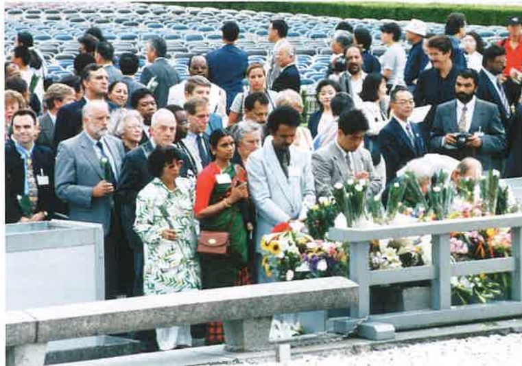
Conference participants dedicating flowers to the Cenotaph for A-bomb Victims