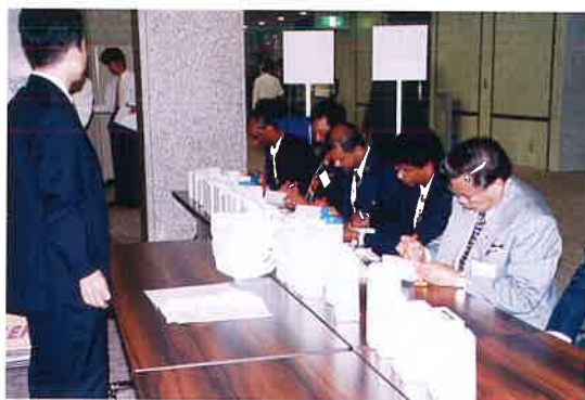
Participants writing peace messages on candles