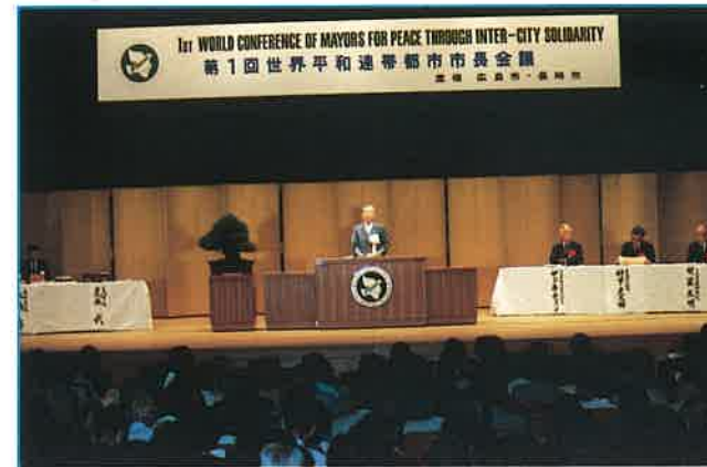
Hiroshima Mayor Takeshi Araki delivers an address during the opening ceremony.