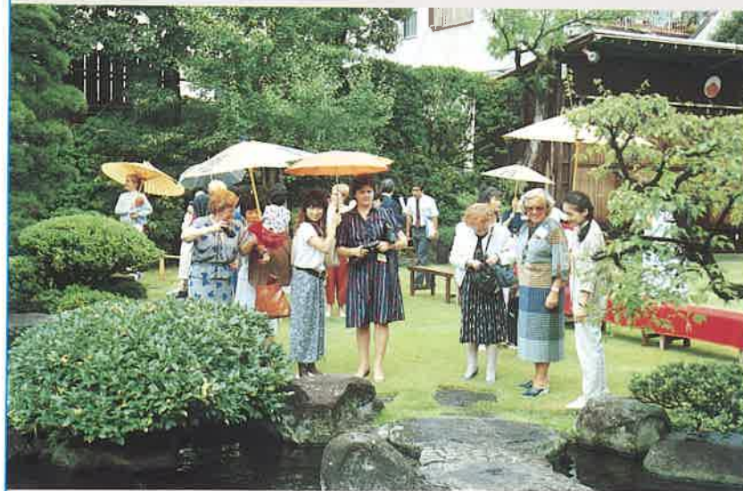
Wives of foreign mayors enjoy the Japanese garden of "Kagetsu."