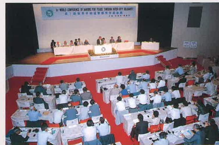
In the Plenary Session III, 19 cities made presentations on "Roles of cities to attain peace."