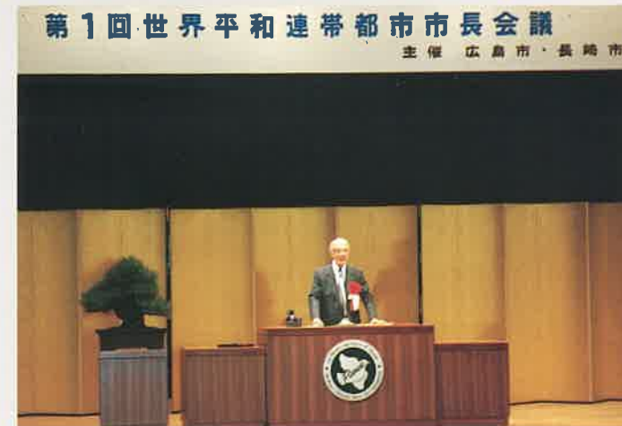
A keynote address by the Nobel Peace Prize winning Alfonso Garcia-Robles, Permanent Representative of Mexico to the Conference on Disarmament.