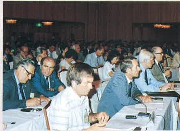
About 200 delegates take part in the discussion. They represented 67 cities in 22 foreign countries and 33 local governments in Japan.