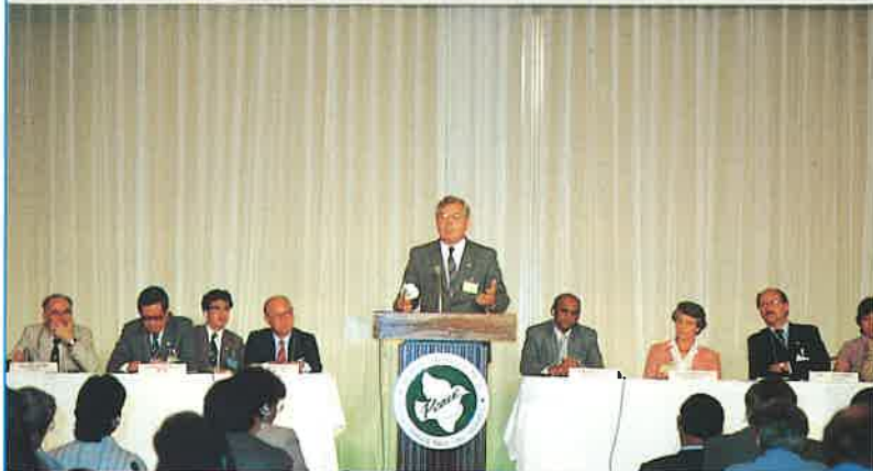
Volgograd Mayor Vladimir I. Atopov (above) and Vancouver Mayor Michael F. Harcourt (right) make presentations on roles of cities toward peace during the Plenary Session II.