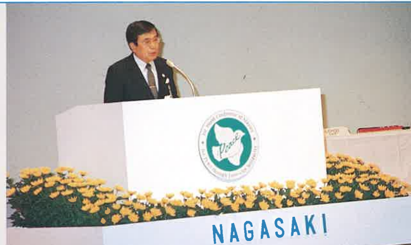
Nagasaki Mayor Hitoshi Motoshima makes an opening address at the Nagasaki session of the conference.