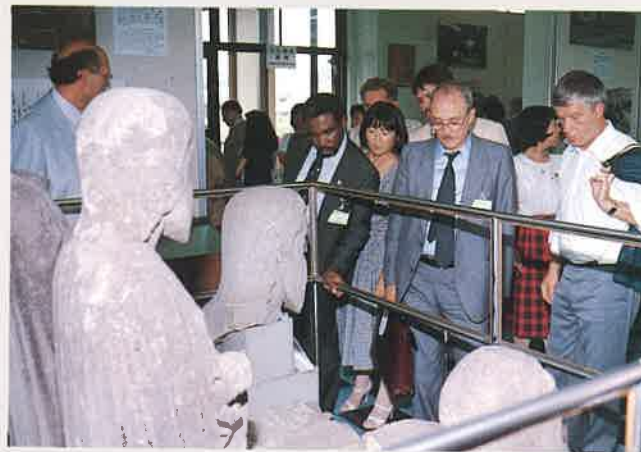
Participants view exhibits at the Atomic Bomb Museum in the Nagasaki International Culture Hall.