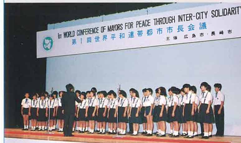
A choir of boys and girls welcomes the conference participants.