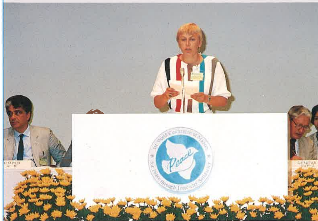
Amsterdam Alderman Tineke Van den Klinkenberg makes presentation in the Plenary Session III on the theme of "Roles of cities to attain peace."