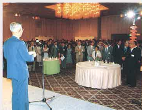
Mayor Takeshi Araki of Hiroshima welcomes the guests at a reception.