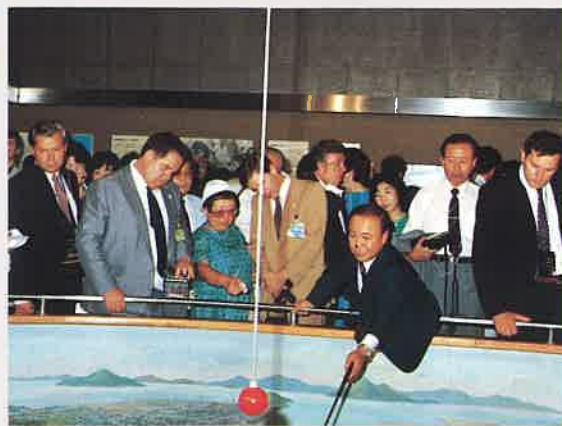
Delegates to the conference tour through the Hiroshima Peace Memorial Museum where the remains of the A-bomb havocs are on display.