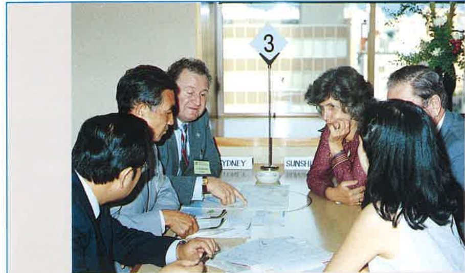
Delegates meet with A-bomb survivors.