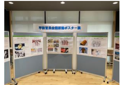
Holding the Mayors for Peace Atomic Bomb Poster Exhibition by a member city (August 2023, Kadogawa)