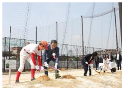
Planting ceremony of a second generation atomic bomb survivor trees seedling by a member city (March 2024, Obu)