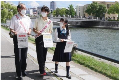
Petition Drive by the President and high school students in the street (August 2022, Hiroshima)