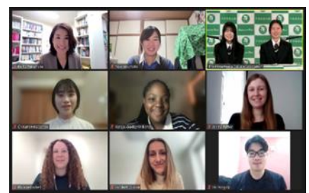
Holding a Peace Education Webinar (February 2024, Hiroshima)