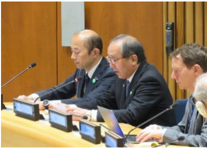
Speech by the President at the second Meeting of States Parties to the Treaty on the Prohibition of Nuclear Weapons (November 2023, New York)