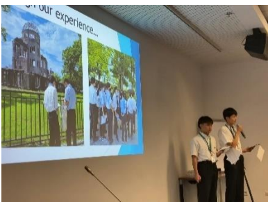
Presentation by Mayors for Peace youths at the Mayors for Peace Youth Forum held in UNOG (August 2023, Vienna)