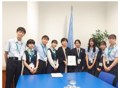
Presenting signatures to the representatives of UN by high school students participating in the petition drive (July 2023, Vienna)