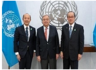
Meeting with UN Secretary-General Guterres (November 2023, New York)