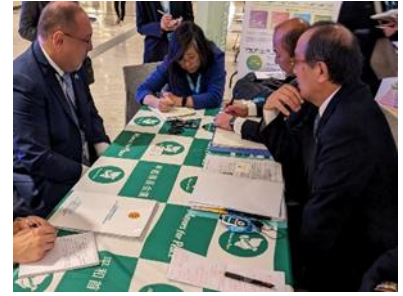
Meeting with national government representatives (November 2023, New York)