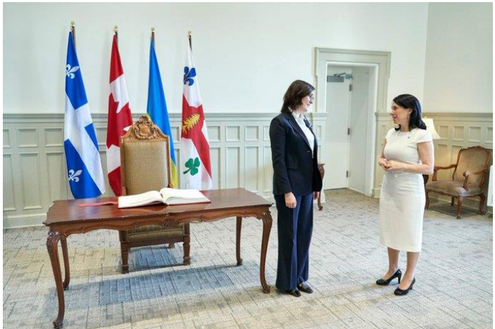
(above) H.E. Ambassador of Ukraine to Canada, Mrs. Yulia Kovaliv (left), with Mayor Valerie Plante.

On April 8, at the occasion of a <u>conference</u> organized by the Council of Europe, the Mayor of Montréal, Ms. Valérie Plante, had the opportunity to address the mayors of several Ukrainian cities to directly express her <u>support</u>, on behalf of Montrealers. Mayor Plante also had a <u>meeting</u> with the Ukrainian Ambassador in Canada to explore ways in which the City could contribute to peace efforts.