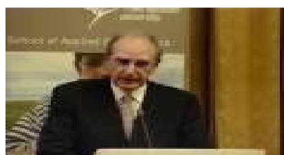
Senator George Mitchell gives the 2008 lecture