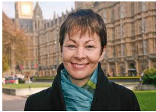
Caroline Lucas MP

Since 1987, the Politics and Applied Global Ethics Department of Leeds Beckett University and the Leeds City Council 'Peacelink' Group, in association with the UK and Ireland Mayors for Peace Chapter, work together to organise the annual Leeds Olof Palme Memorial Peace Lecture.