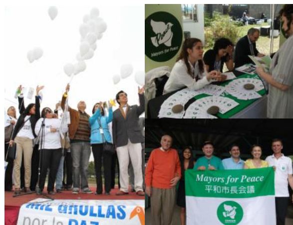
Activities in Latin America: Peru (left), Argentina (upper right) and Costa Rica (lower right)

Bank Account : Vredesfonds Stad Ieper Bank name : DEXIA Account Number : 088-2371003-27 IBAN nr. : BE48-0882-3710-0327 BIC(SWIFT code) : GKCCBEBB