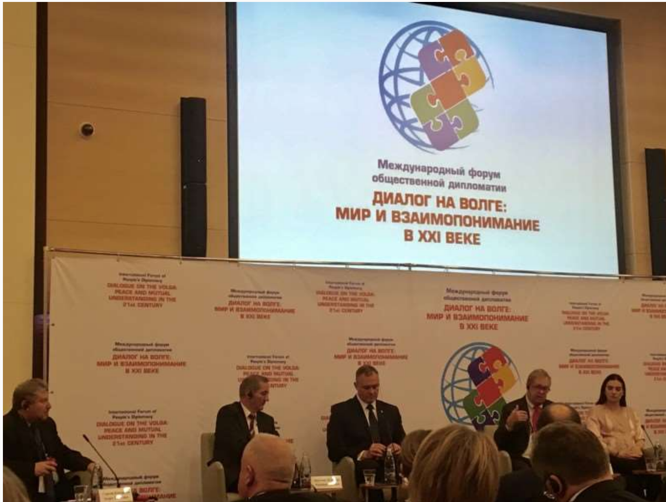
International forum “Dialogue on Volga: peace and mutual understanding in the XX century” (November, 2017)