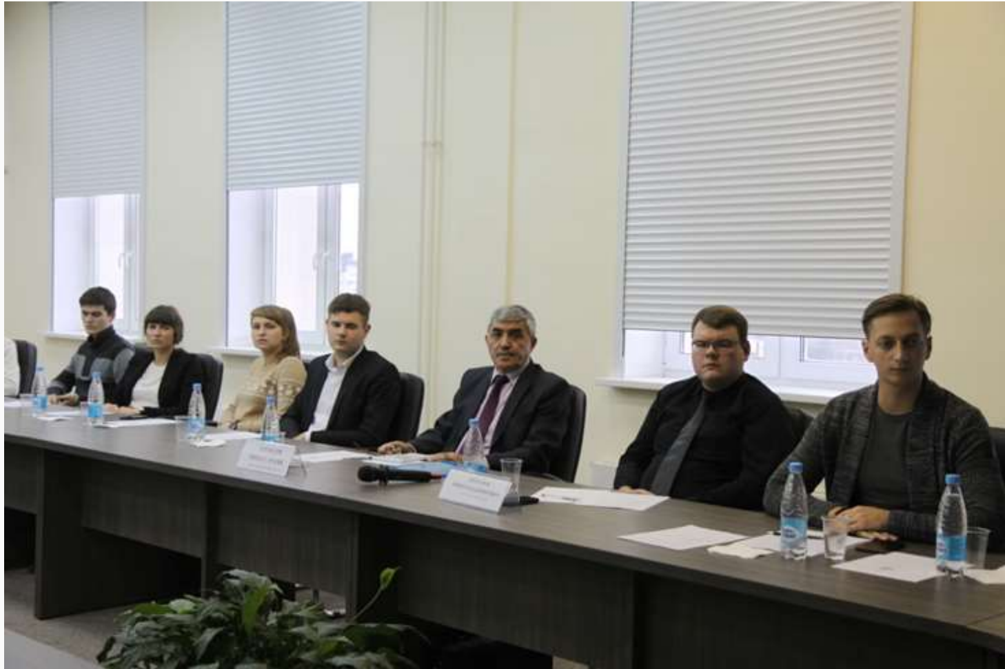
Round table “Public diplomacy in the modern world: youth in the peacemaking process and international cooperation” (2017/10/26)