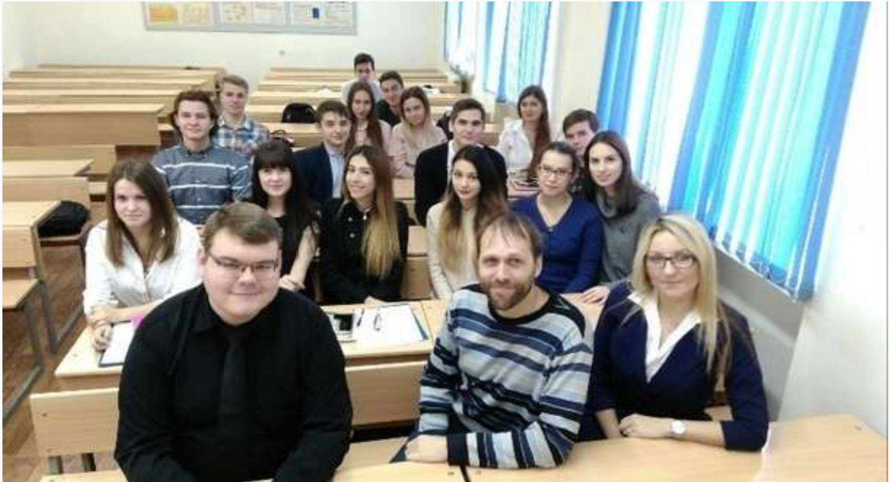
Assembly of Volgograd State University International Discussion Club (2017/15/11)