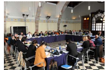
The 8th Executive Conference of Mayors for Peace