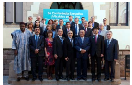
Participants of the 8th Executive Conference