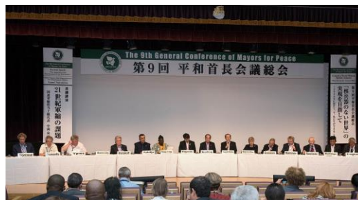
9th General Conference of Mayors for Peace held in Nagasaki in August 2017

In August 1945, single atomic bombs dropped on the cities of Hiroshima and Nagasaki instantaneously reduced them to rubble, taking vast numbers of precious lives. To ensure that the atomic tragedy is never repeated anywhere on earth, Hiroshima and Nagasaki have consistently sought to persuade the world that nuclear weapons are inhumane and have continually called for their total abolition.